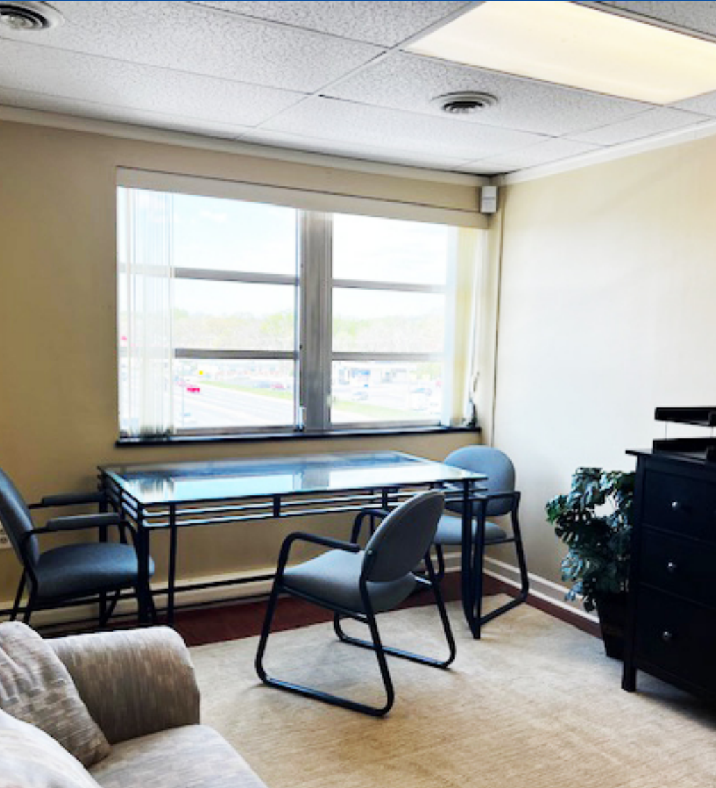
4th Floor Open Area