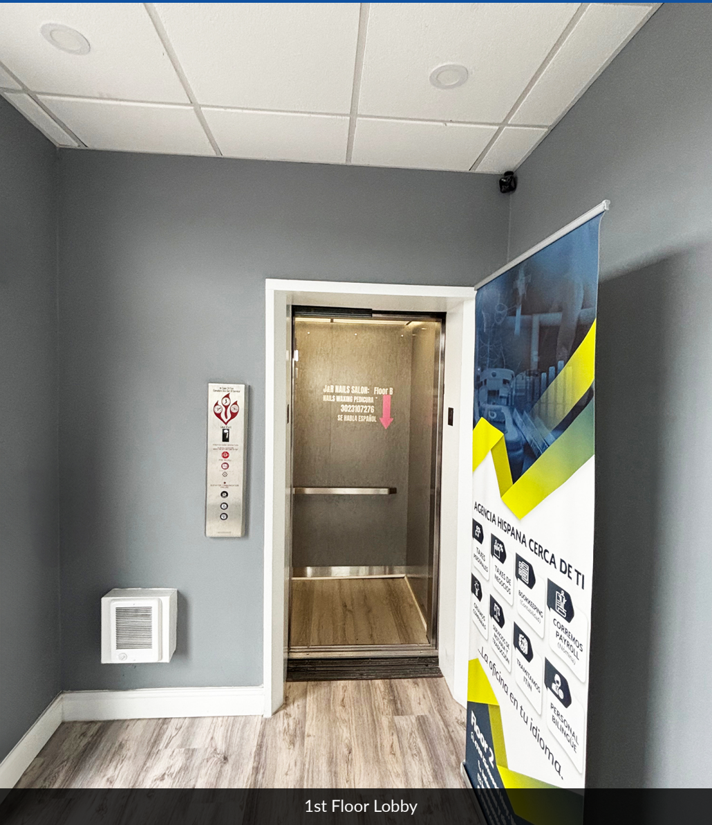
1st Floor Lobby