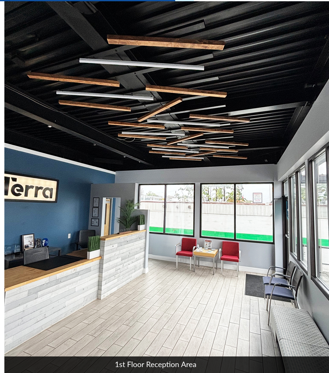
1st Floor Reception Area

TYLER FORESTA Sales & Leasing O: 302.414.1000 | C: 302.584.8615 tforesta@LMTCRE.com