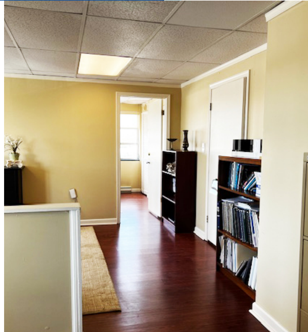
4th Floor Entrance