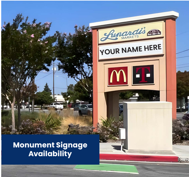
Monument Signage Availability