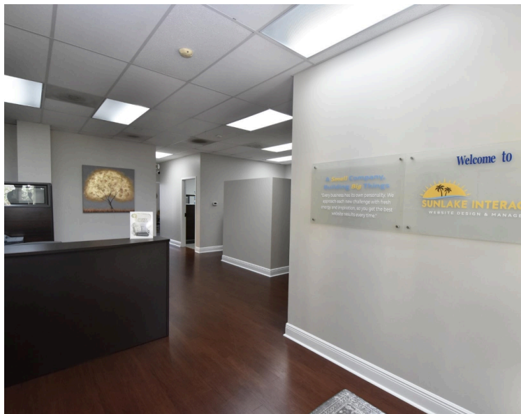
Hudson 206 Interior