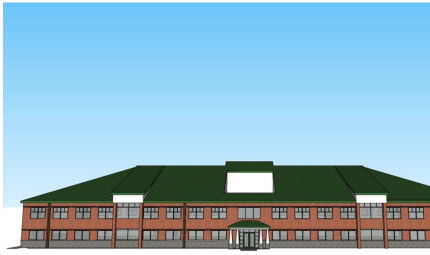
Lincoln Centre - Rear Elevation (Proposed)