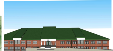
Lincoln Centre Walker Drive • State College • Pennsylvania