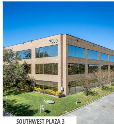
SOUTHWEST PLAZA 3