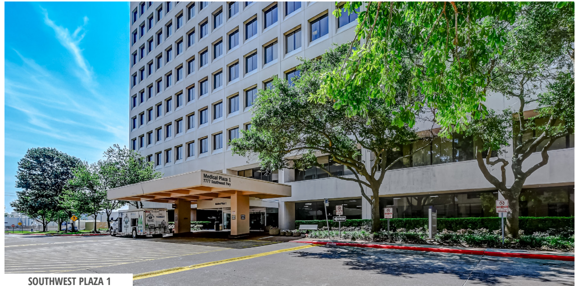
SOUTHWEST PLAZA 1