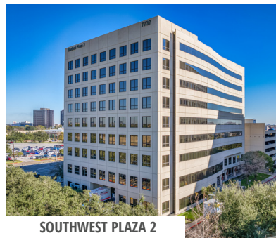
SOUTHWEST PLAZA 2