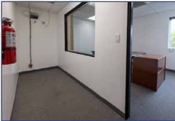
STORAGE / WORK AREA