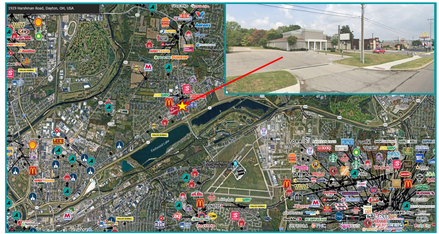
1.44 +/- Acre Outparcel Pad Available for Ground Lease - Building can be torn down