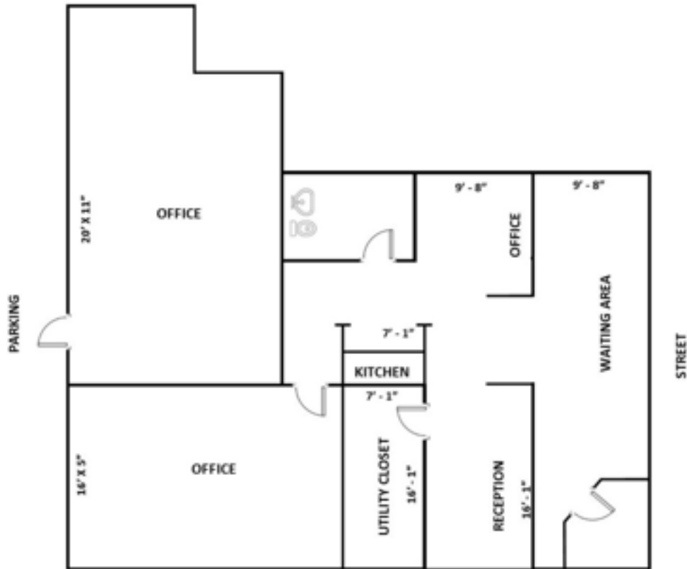
3804 S. Cox Rd