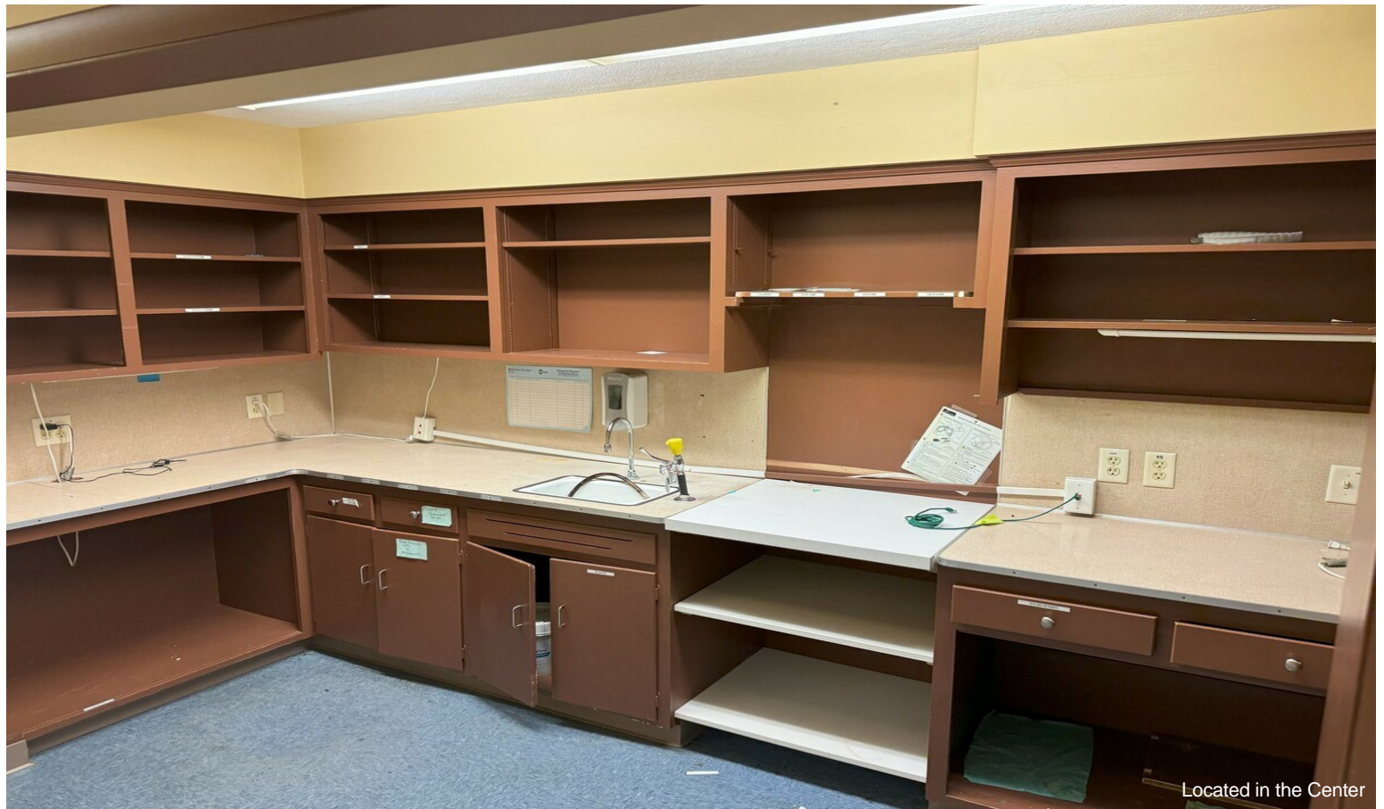
Located in the Center