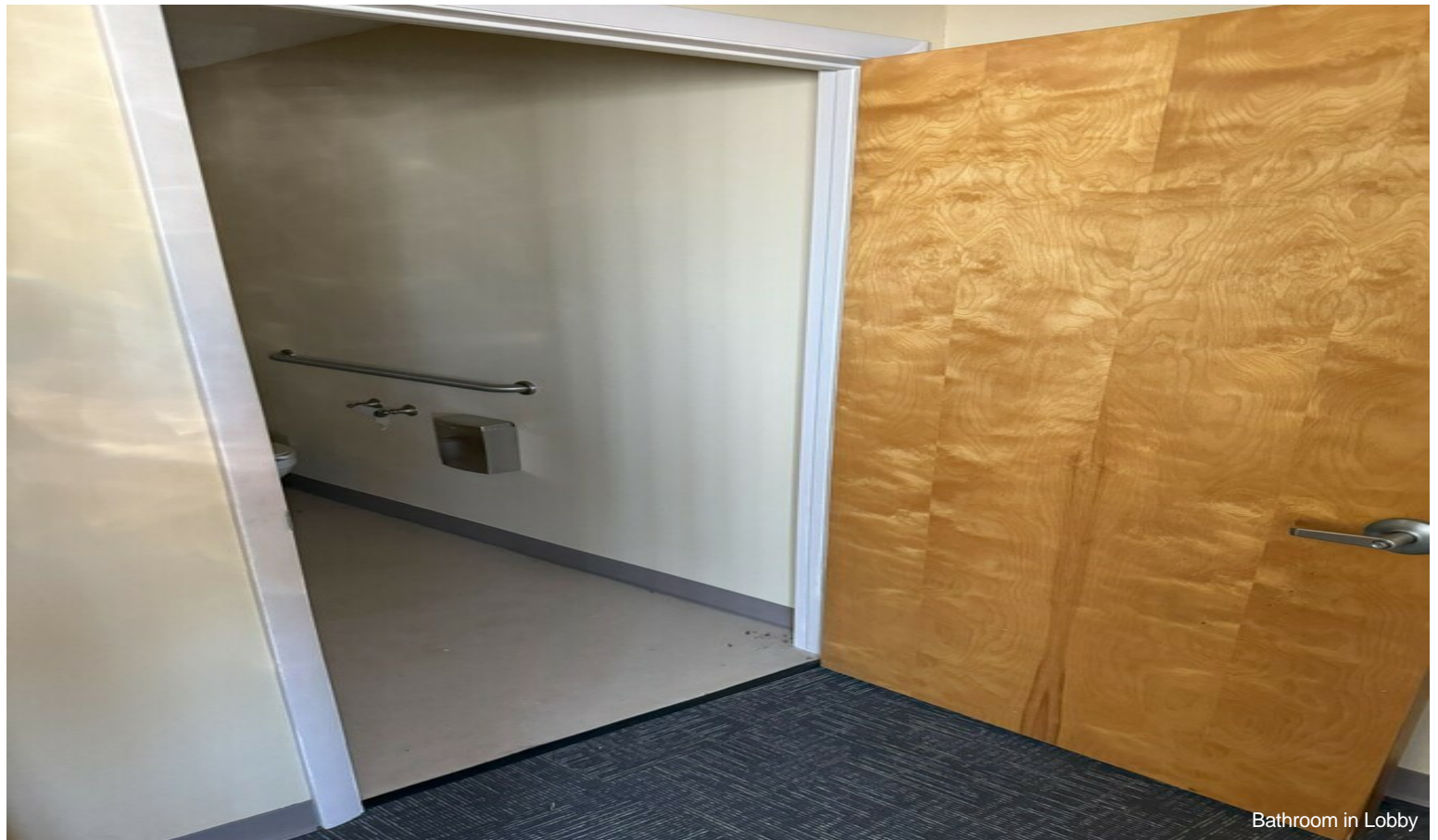
Bathroom in Lobby