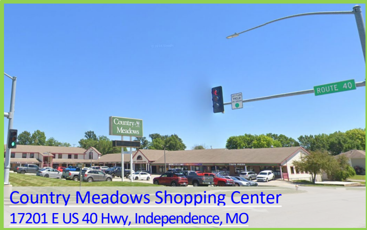
Country Meadows Shopping Center 17201 E US 40 Hwy, Independence, MO