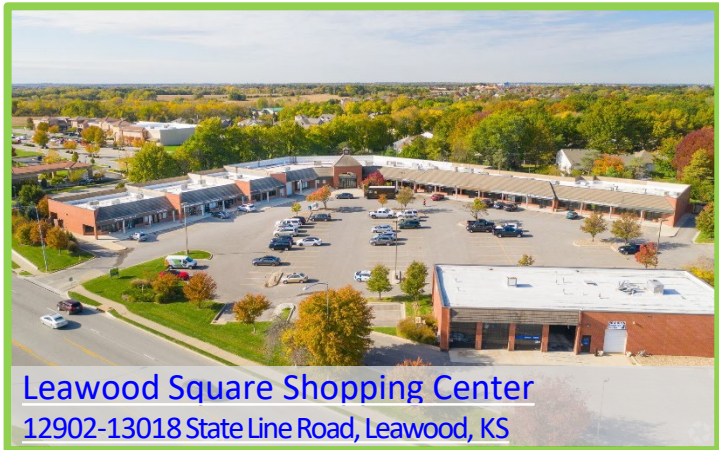
Leawood Square Shopping Center 12902-13018 State Line Road, Leawood, KS