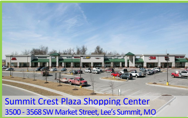
Summit Crest Plaza Shopping Center 3500 - 3568 SW Market Street, Lee's Summit, MO