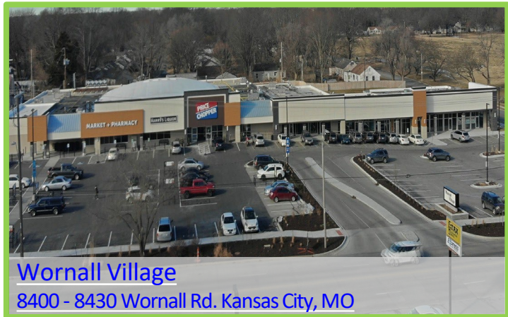
Wornall Village 8400 - 8430 Wornall Rd. Kansas City, MO