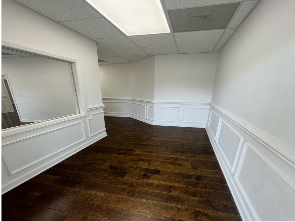
Entry Hall / Reception