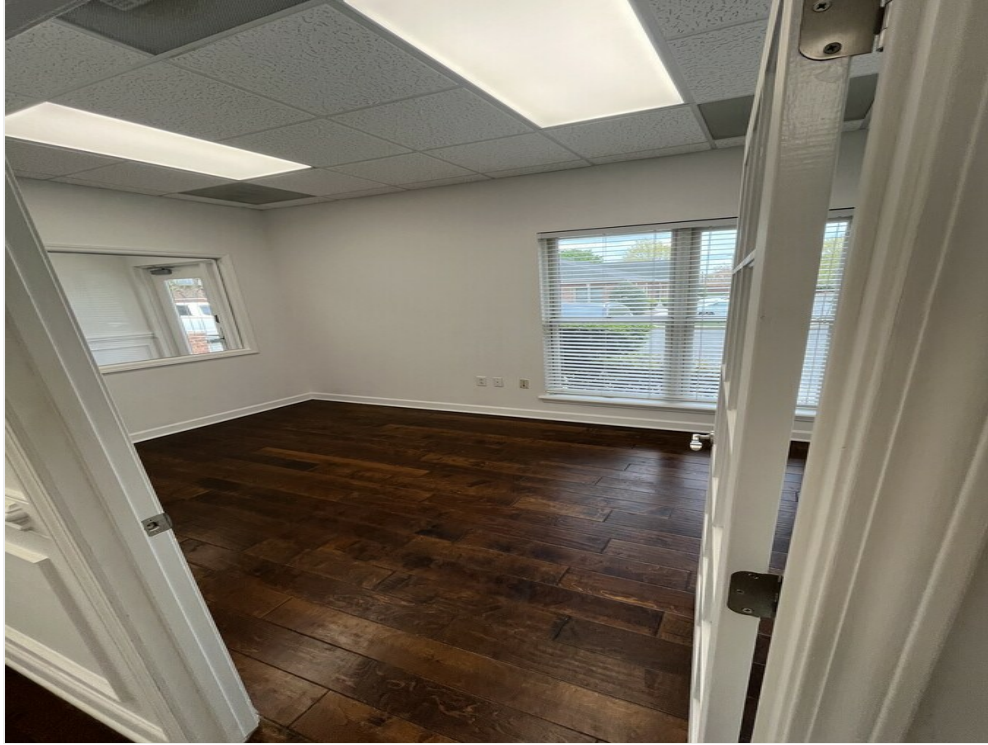
Entry office / reception area