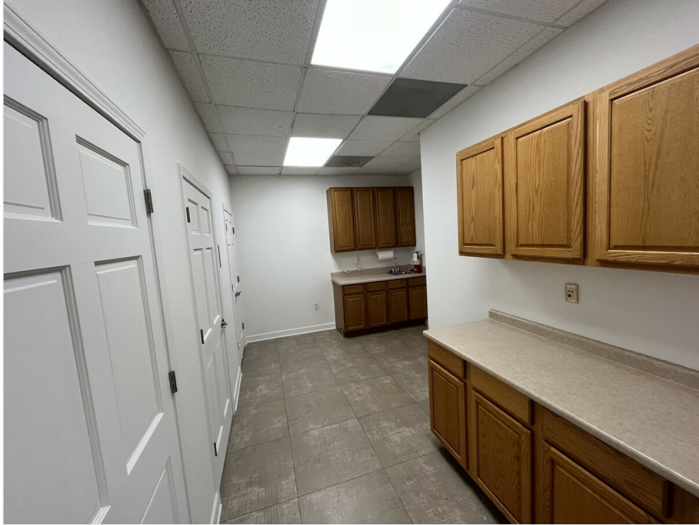
Kitchen / Bathroom area