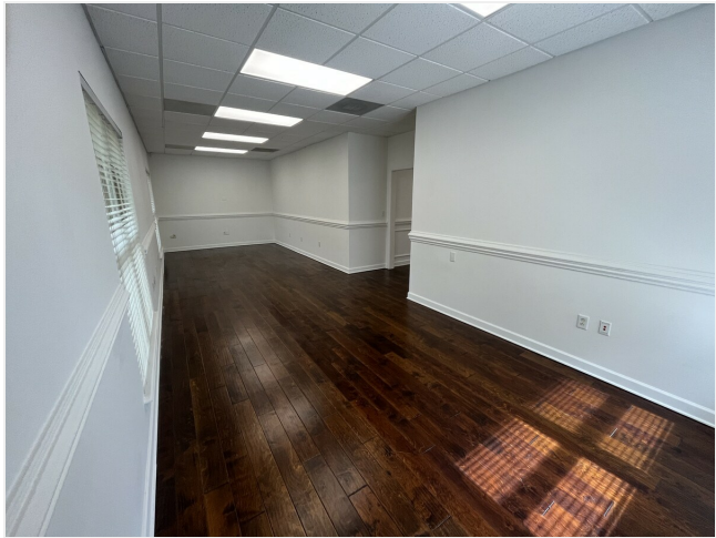
Back Office area

2526 Plantation Center Dr, Matthews, NC 28105