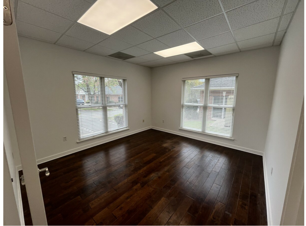
Front Corner Office