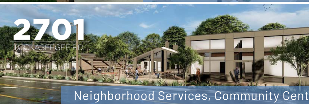
Neighborhood Services, Community Center, Retail, Restaurant, Office +/- 1.053 AC