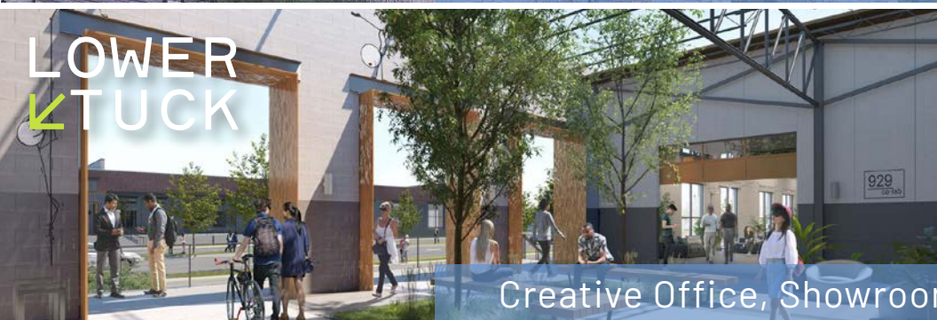
Creative Office, Showroom & Retail +/- 400,000 SF