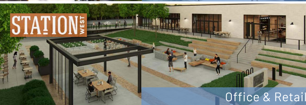
Office & Retail +/- 67,000 SF