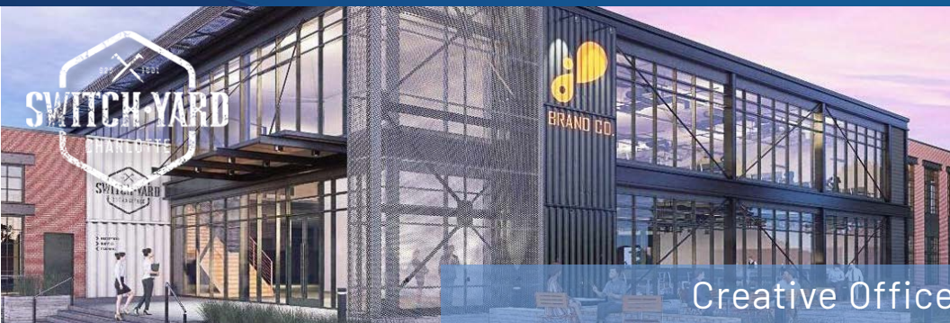
Creative Office +/- 92,000 SF