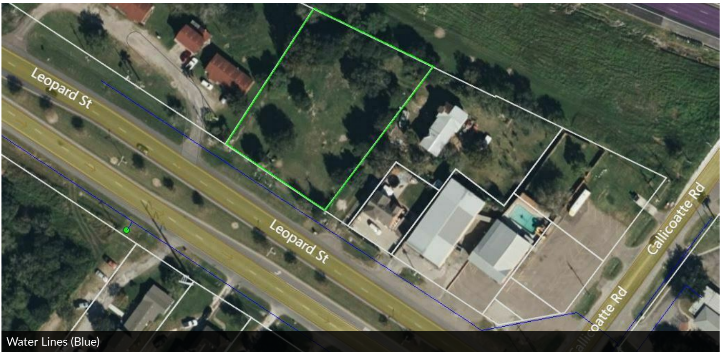
Water Lines (Blue)

DAVID HEITZMAN 361.541.4417 dheitzman@craveyrealestate.com