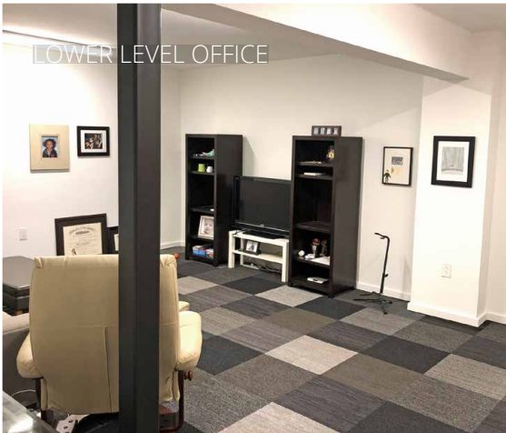
LOWER LEVEL OFFICE