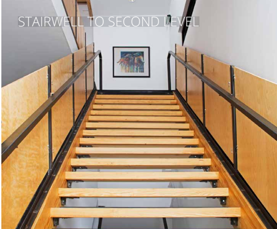
STAIRWELL TO SECOND LEVEL