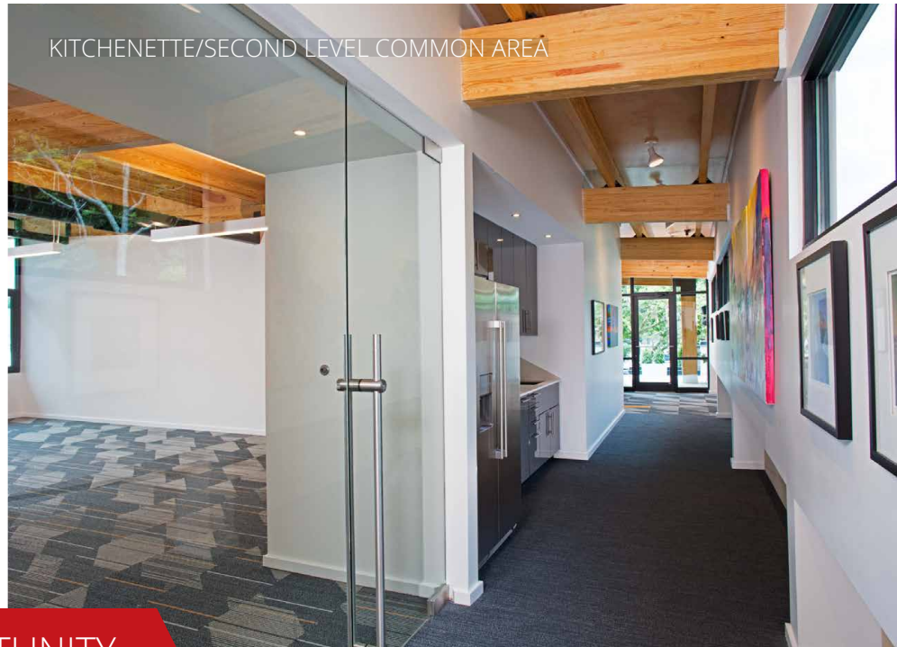
KITCHENETTE/SECOND LEVEL COMMON AREA