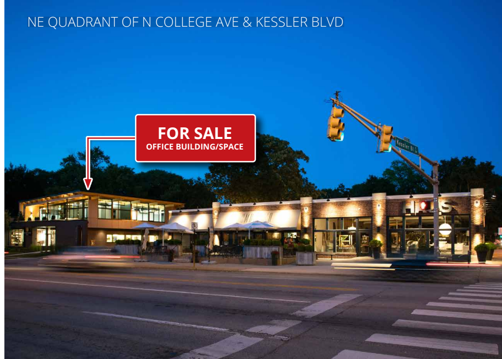
NE QUADRANT OF N COLLEGE AVE & KESSLER BLVD