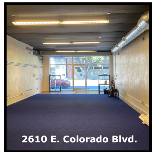
2610 E. Colorado Blvd.

Prime Retail Space on Desirable E. Colorado Blvd. in Pasadena