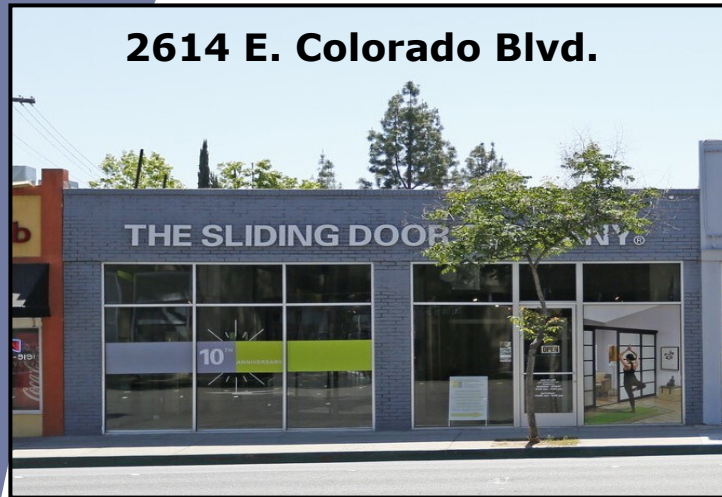
2614 E. Colorado Blvd.