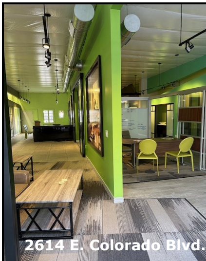
2614 E. Colorado Blvd.