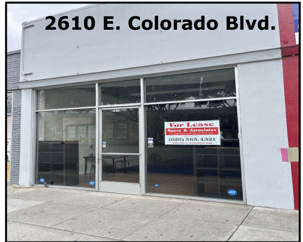
2610 E. Colorado Blvd.