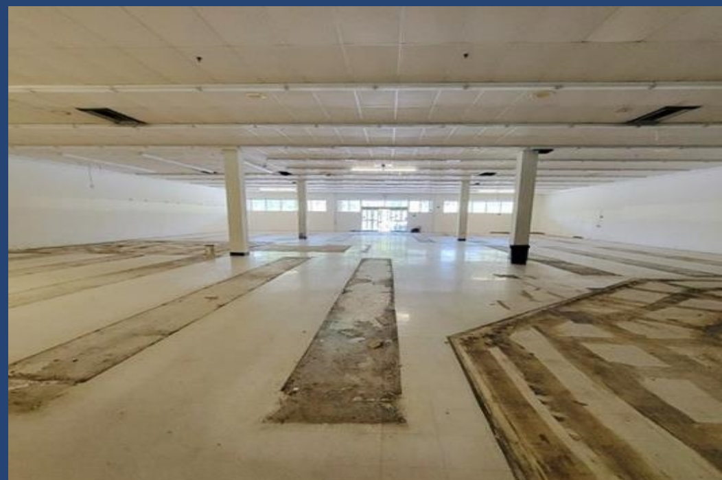
Suite 210 - Interior