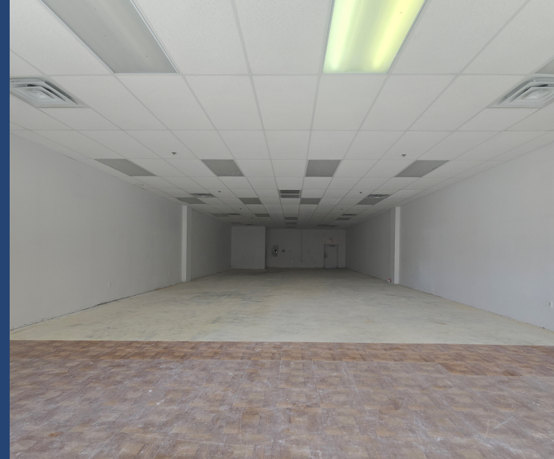
Suite 170 - Interior