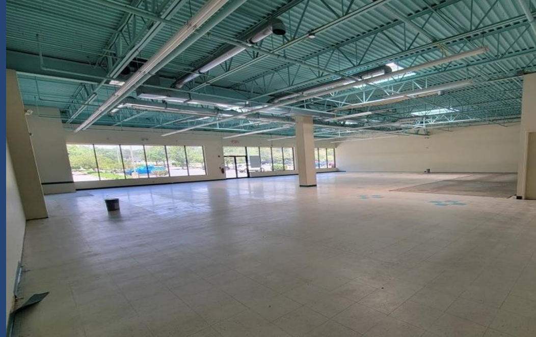
Suite 370 - Interior