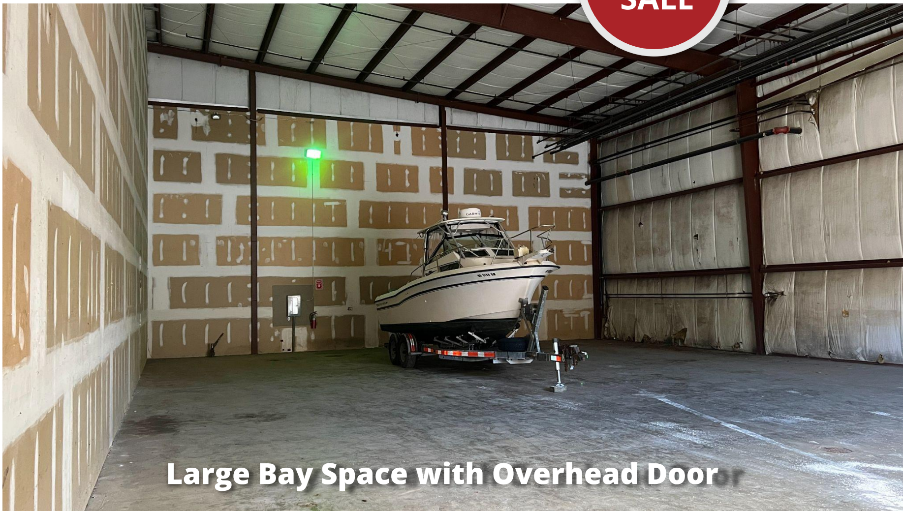
Large Bay Space with Overhead Door