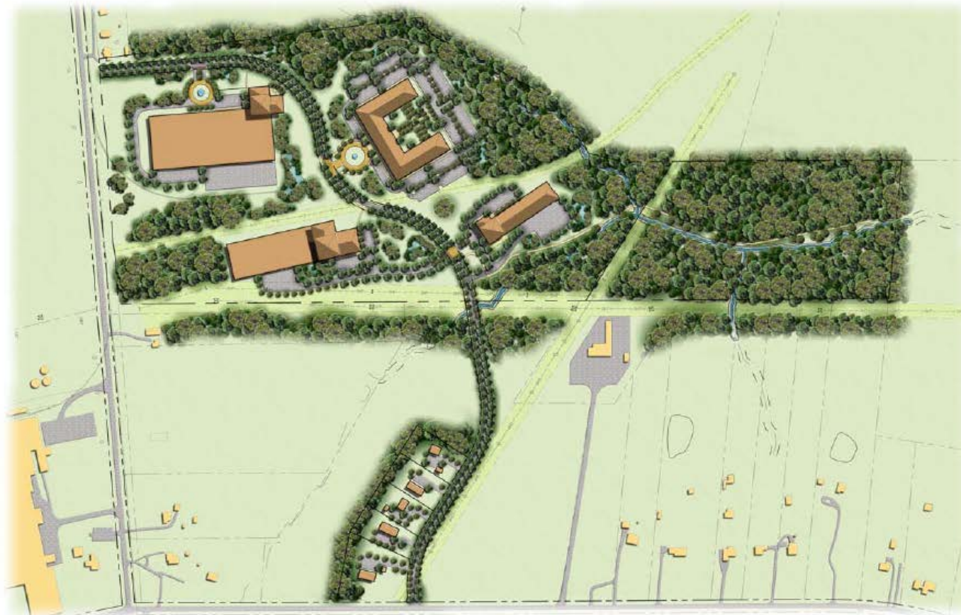
C O N C E P T U A L L A N D - U S E P L A N