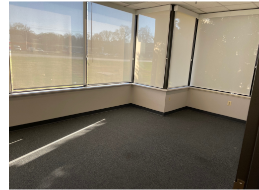
1st Floor Office/Retail - 3,100 SF