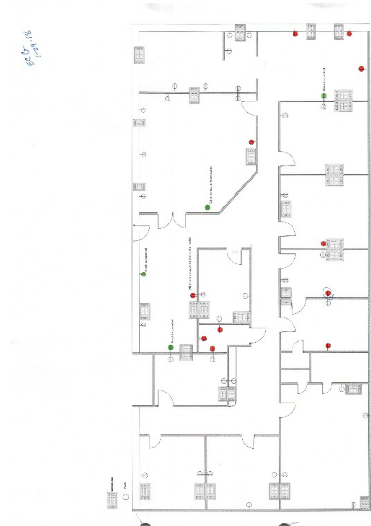
1st Floor Office/Retail Floor Plan