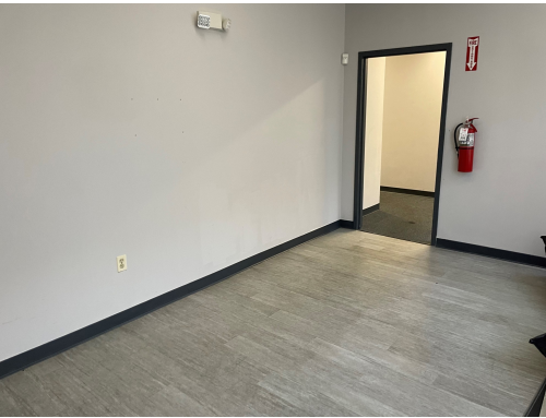
1st Floor Office/Retail - 3,100 SF