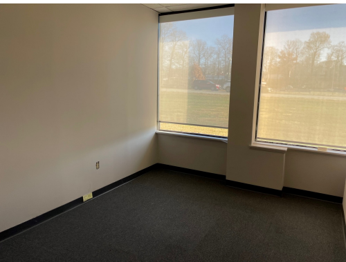
1st Floor Office/Retail - 3,100 SF