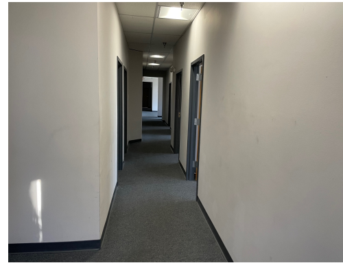
1st Floor Office/Retail - 3,100 SF