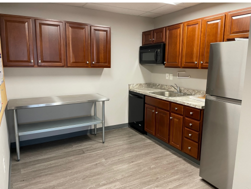
2nd Floor Office - 3,100 SF