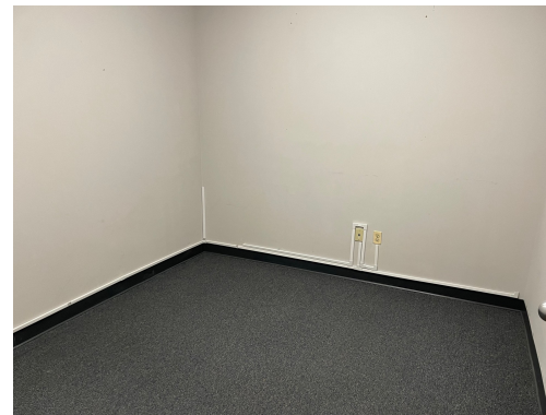
1st Floor Office/Retail - 3,100 SF