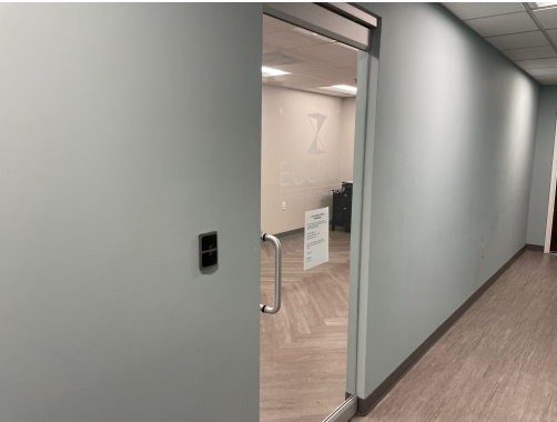
2nd Floor Office - 3,100 SF