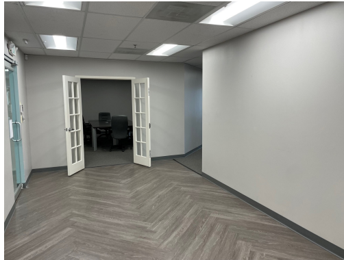
2nd Floor Office - 3,100 SF