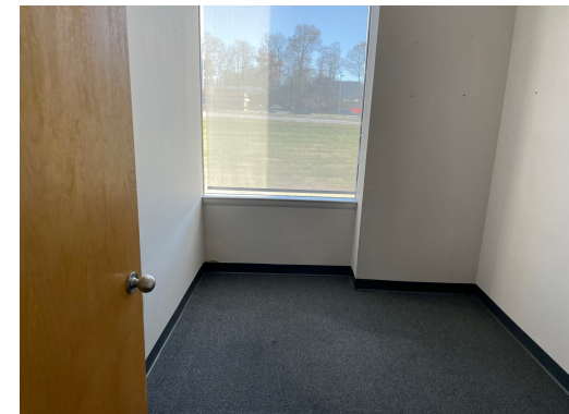
1st Floor Office/Retail - 3,100 SF

Presented By: Scott Douglas 301.655.8253 sdouglas@douglascommercial.com