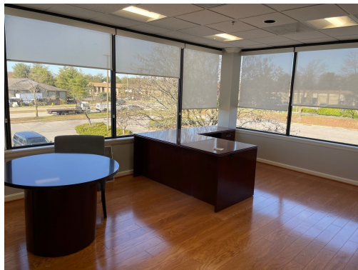
2nd Floor Office - 3,100 SF