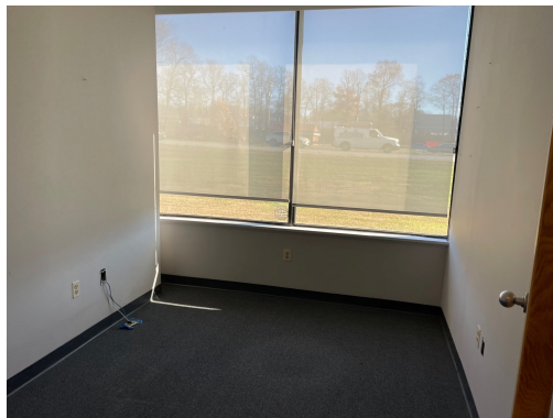
1st Floor Office/Retail - 3,100 SF