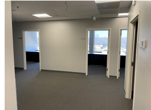
2nd Floor Office - 3,100 SF