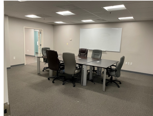
2nd Floor Office - 3,100 SF