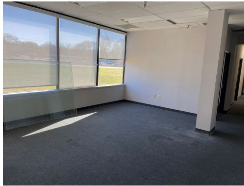
1st Floor Office/Retail - 3,100 SF