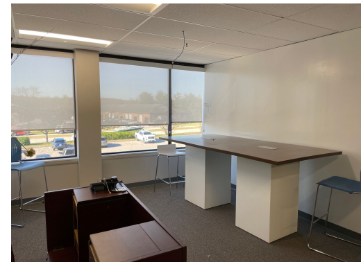
2nd Floor Office - 3,100 SF

Presented By: Scott Douglas 301.655.8253 sdouglas@douglascommercial.com