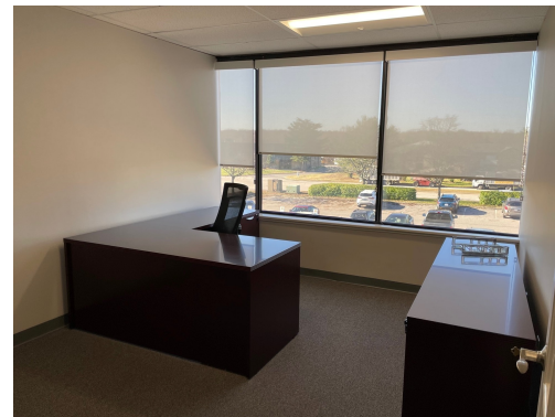
2nd Floor Office - 3,100 SF