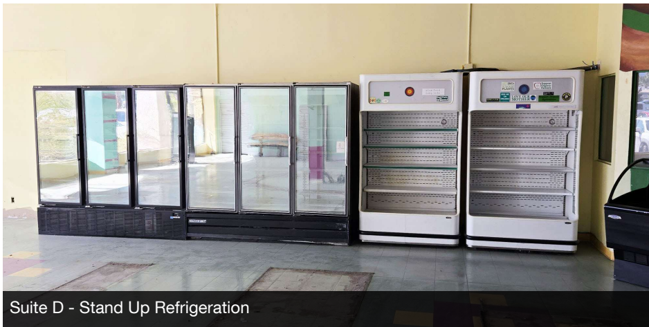
Suite D - Stand Up Refrigeration