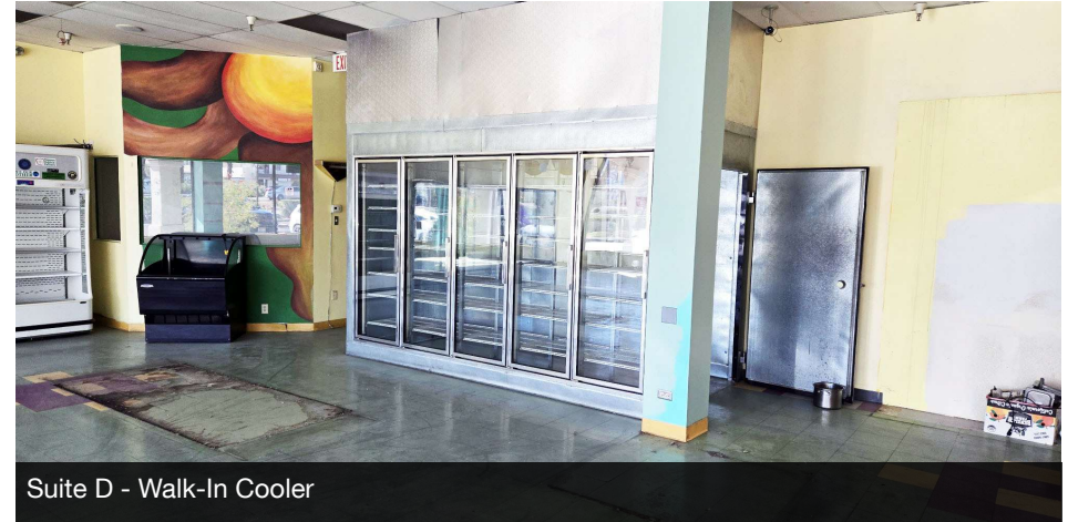
Suite D - Walk-In Cooler