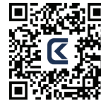
3D MATTERPORT TOUR