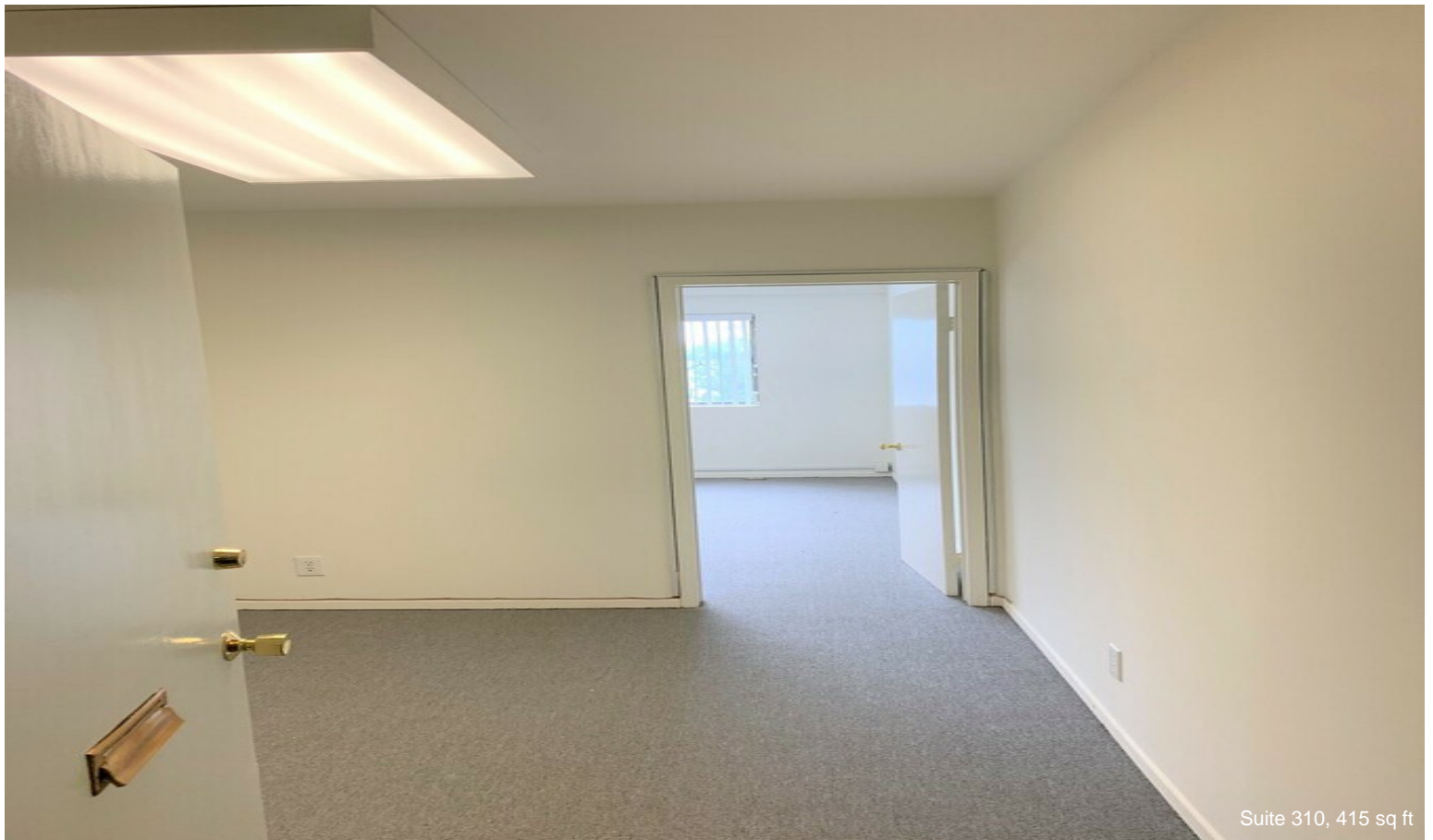
Suite 310, 415 sq ft