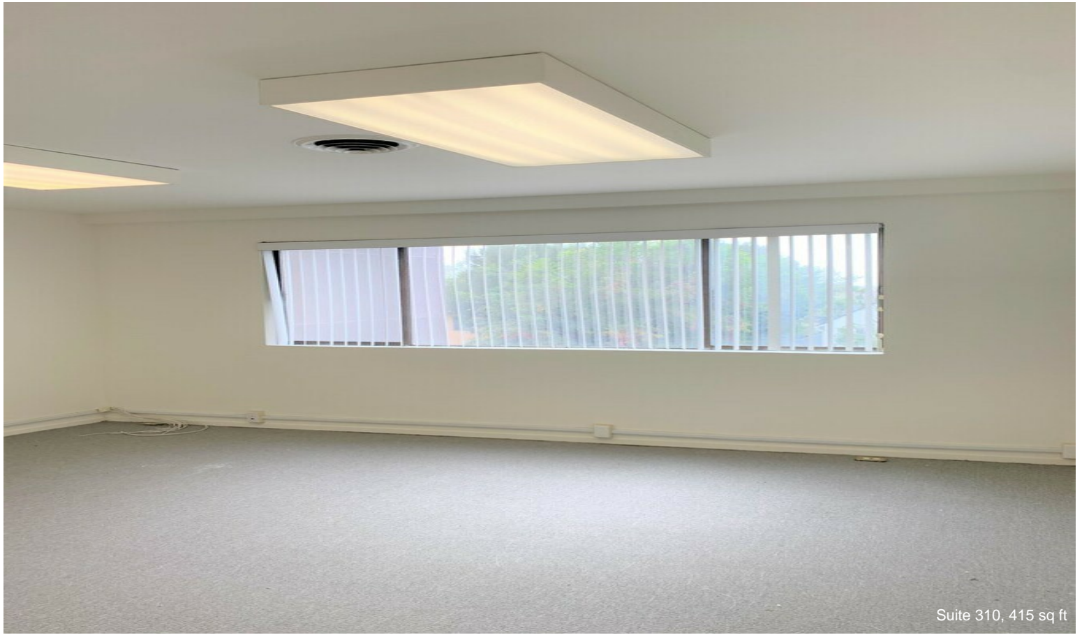
Suite 310, 415 sq ft