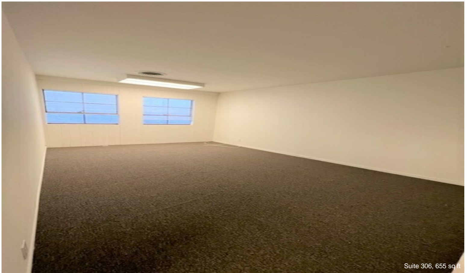
Suite 306, 655 sq ft