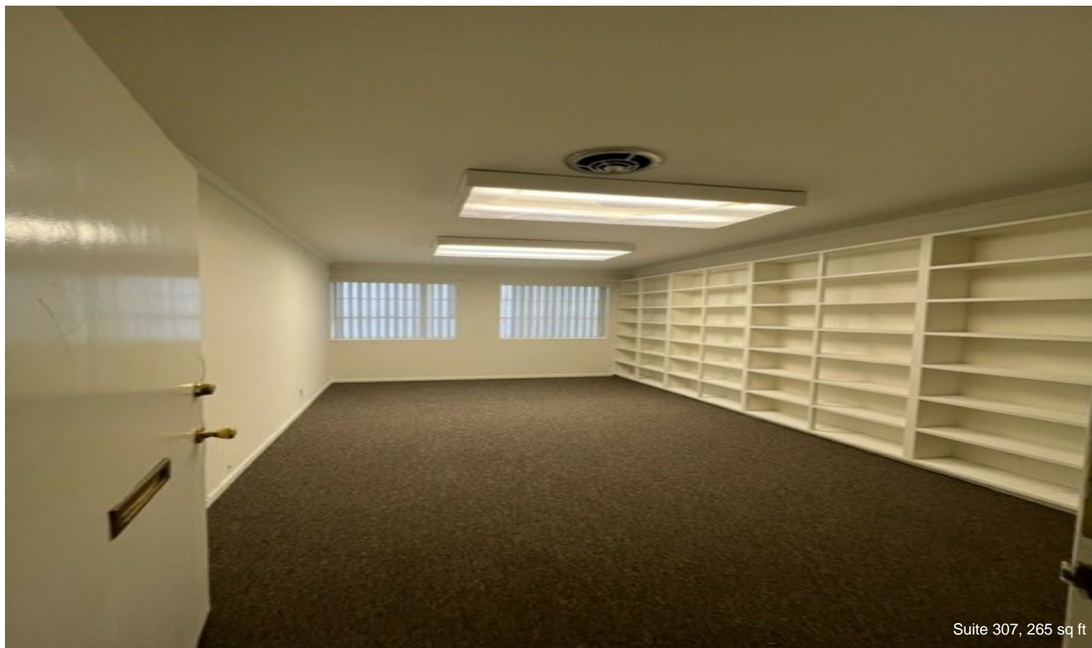
Suite 307, 265 sq ft