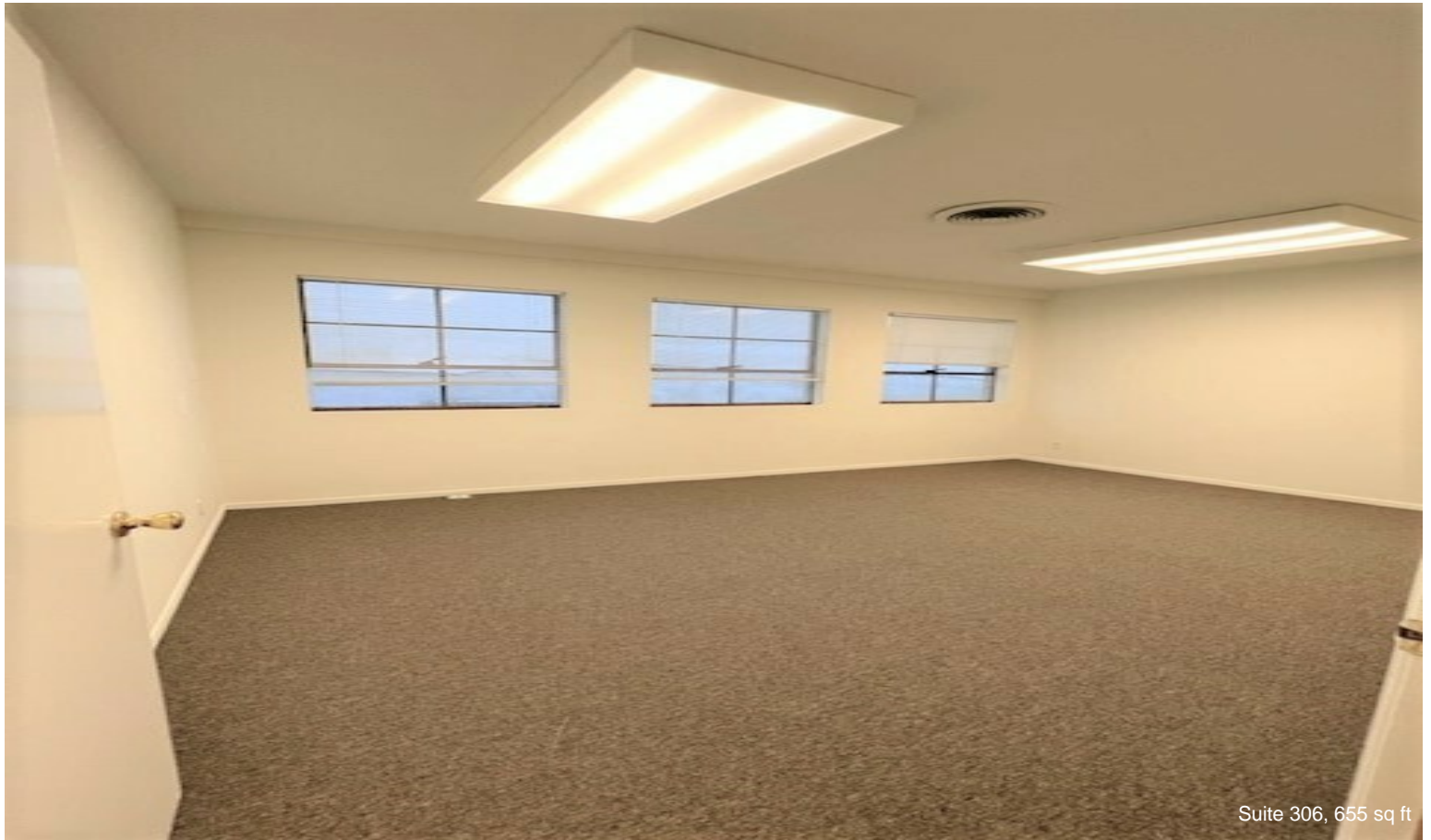
Suite 306, 655 sq ft