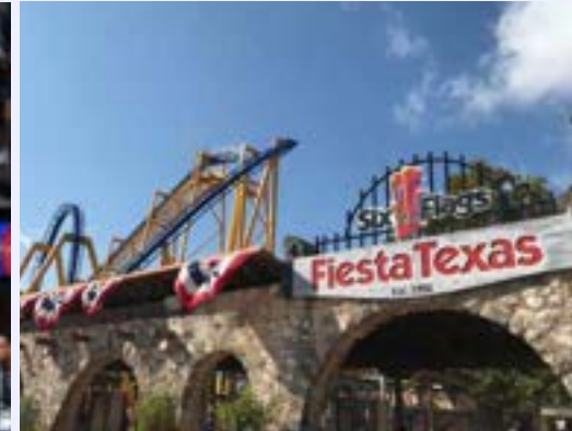
SIX FLAGS OVER TEXAS FIESTA TEXAS