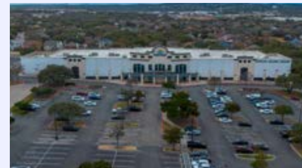
SANTIKOS SILVERADO ≈ 1 MILE FROM SITE