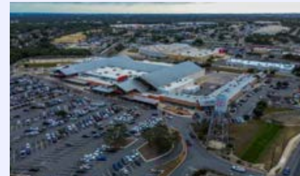
H-E-B PLUS! 1604 & BANDERA ≈ 1.1 MILES FROM SITE