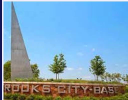
BROOKS CITY BASE