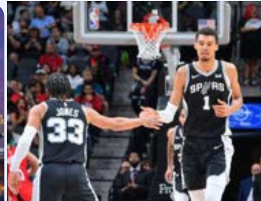
SAN ANTONIO SPURS