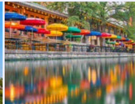
SAN ANTONIO RIVERWALK