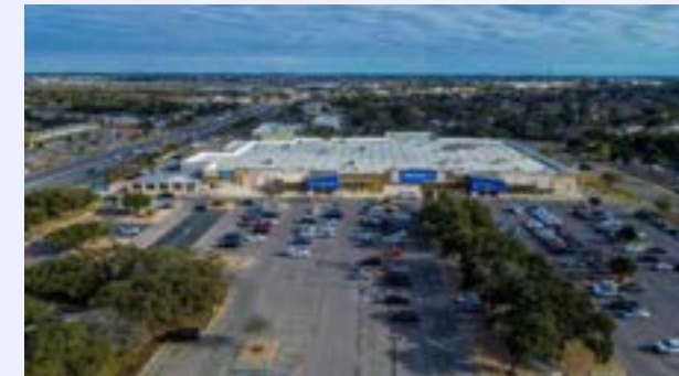
WALMART SUPERCENTER ADJACENT TO CENTER ON BANDERA RD.