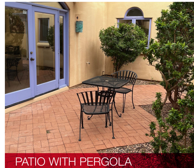
PATIO WITH PERGOLA