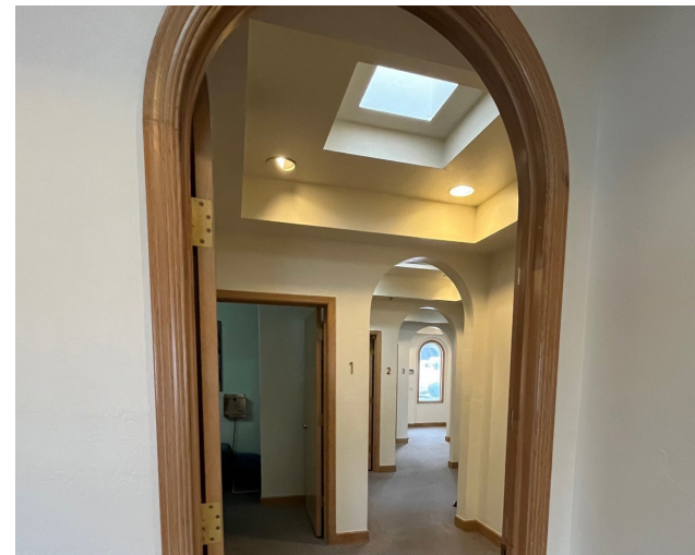
HALLWAY TO EXAM ROOMS