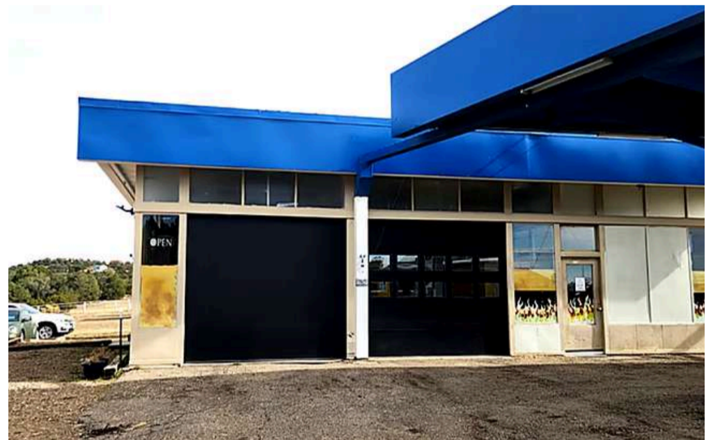
North building and canopy