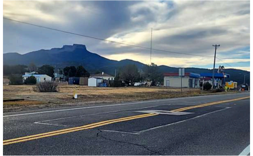
East view from Santa Fe Trail and Fisher's Peak State Park