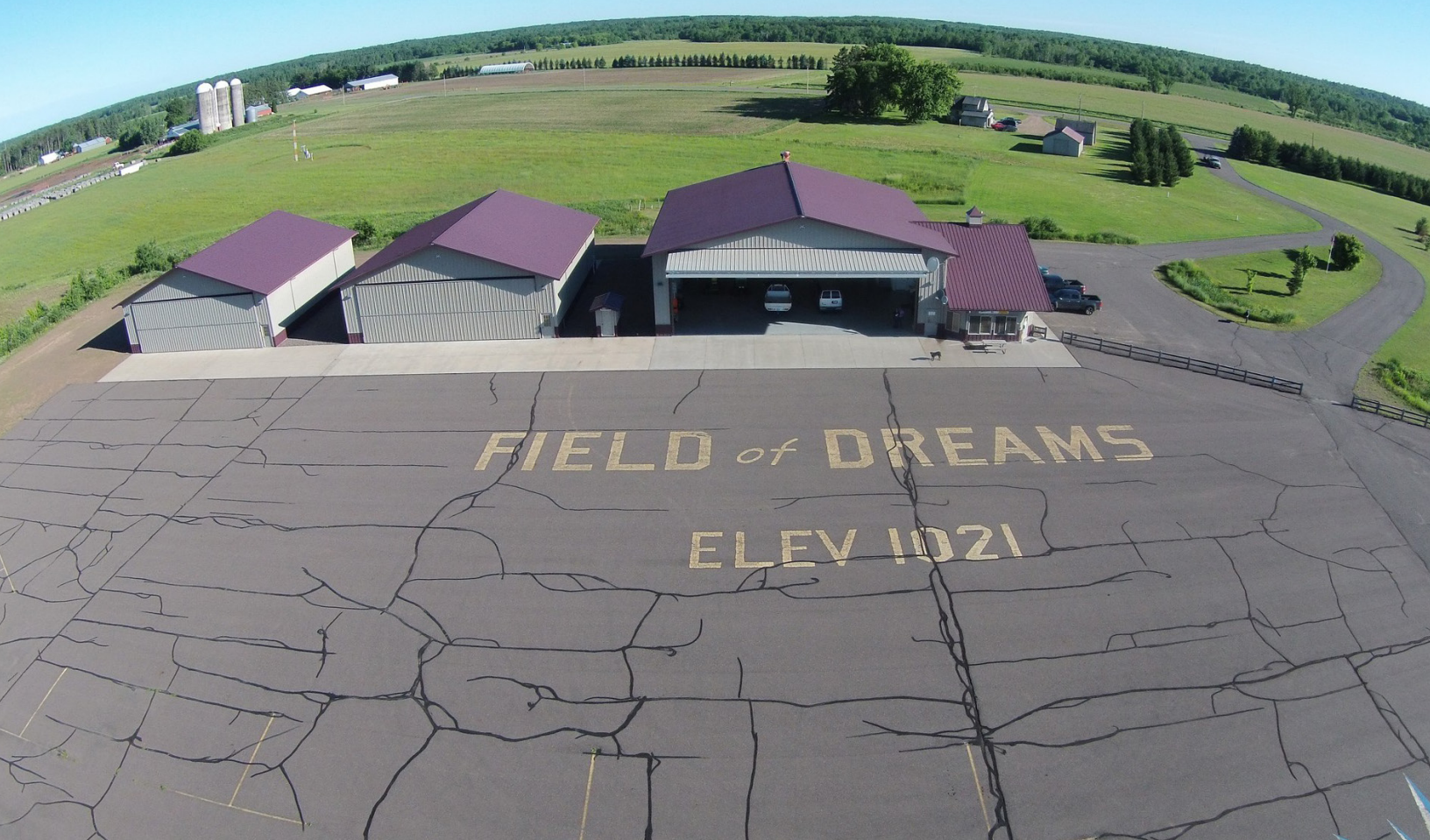
8000 SF MAIN HANGAR, 24' X 48' OFFICE BUILDING ATTACHED, PLUS TWO ADDITIONAL HANGARS W/ LAND FOR EXPANSION