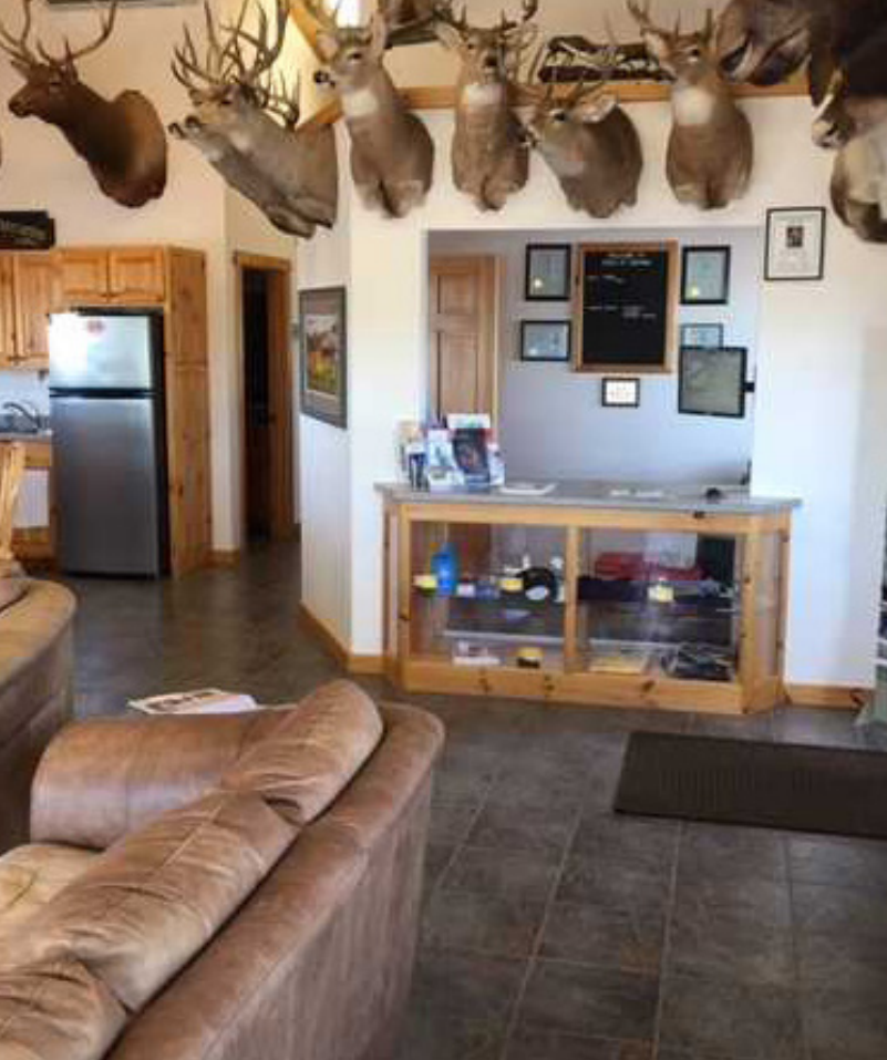
RECEPTION/ SALES DESK