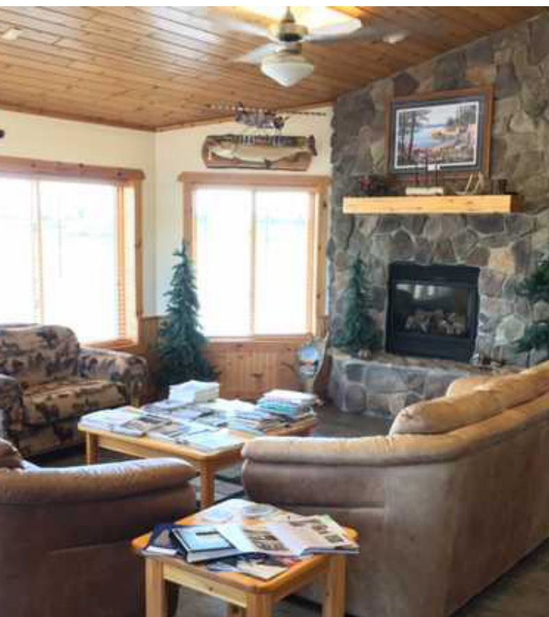
LOBBY WITH FIREPLACE