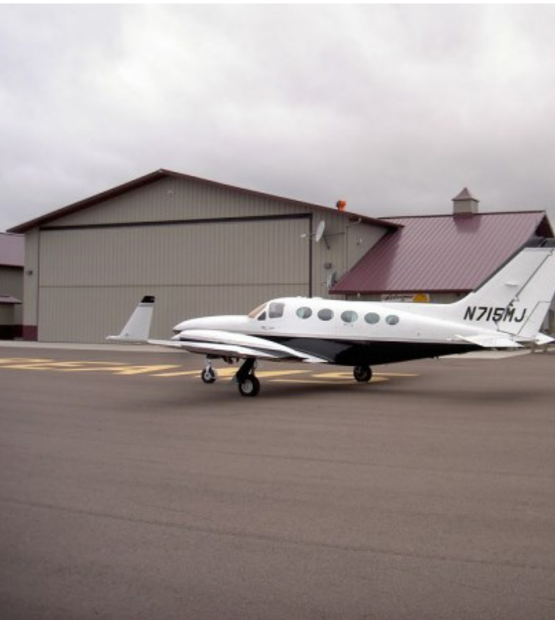
MAIN HANGAR 60'X 18' CLEAR HT DOOR, AUTO LOCK, REMOTE CONTROL