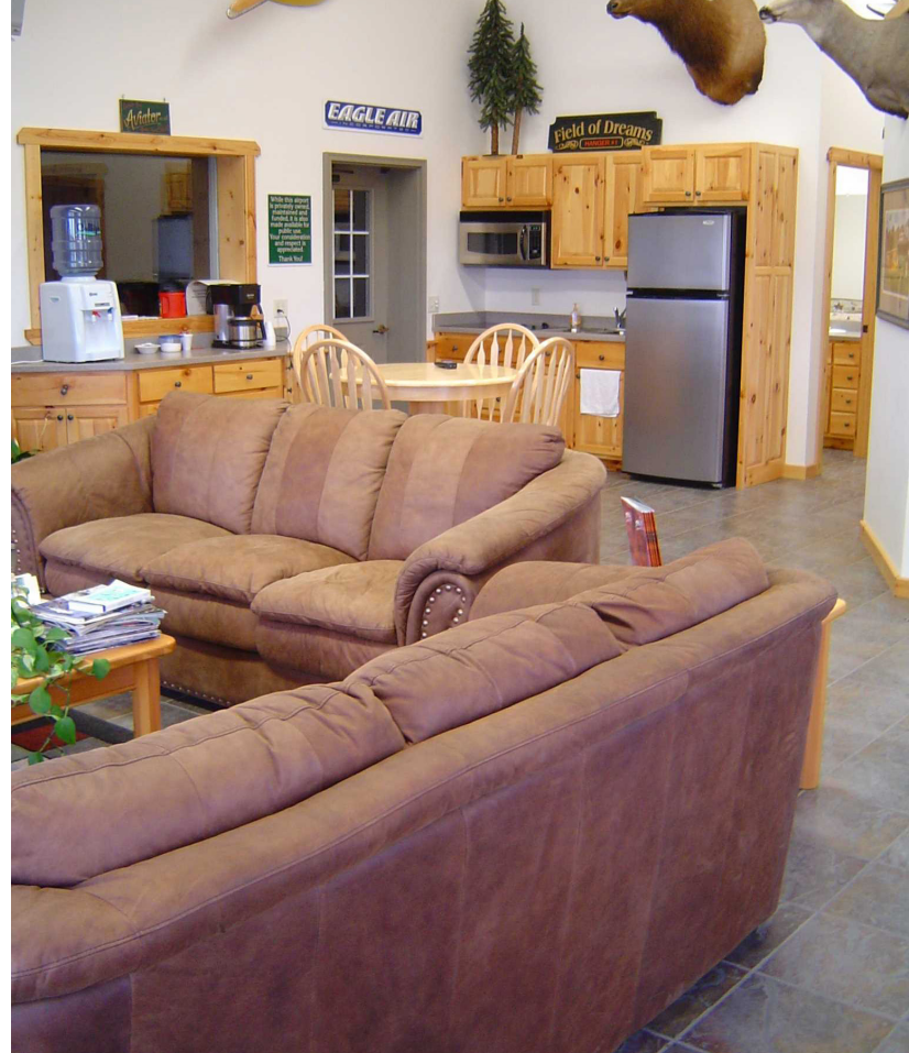
KITCHENETTE, TWO RESTROOMS W/ SHOWER