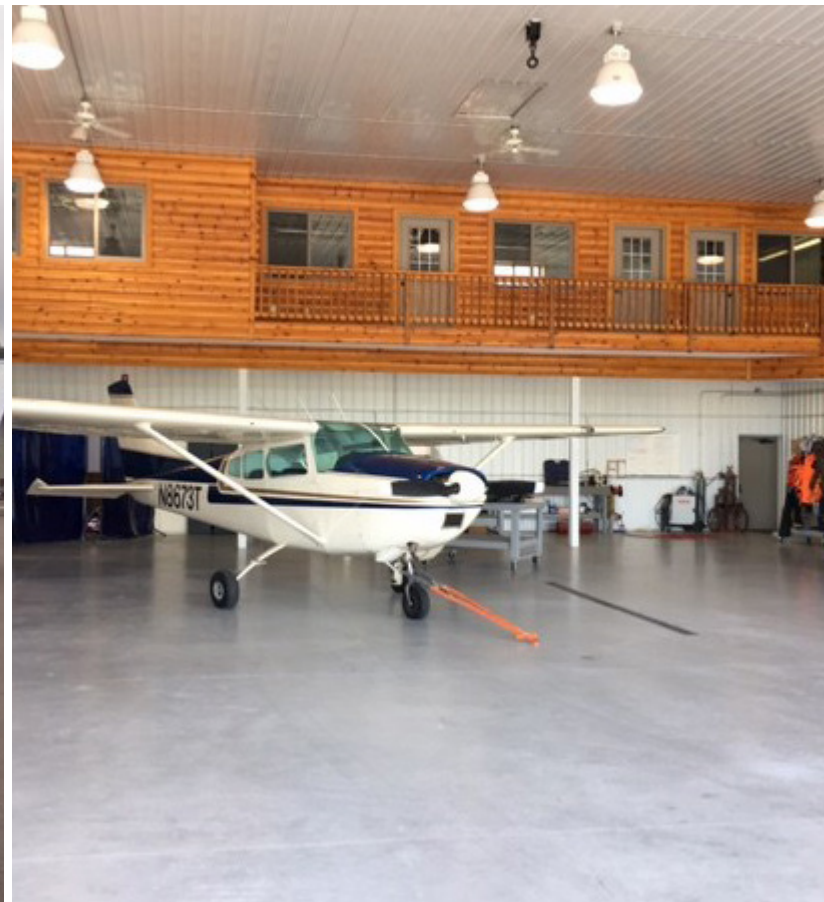
MAIN HANGAR HAS MEZZANINE, CONFERENCE RM, 3 OFFICES, RR, KITCHENETTE