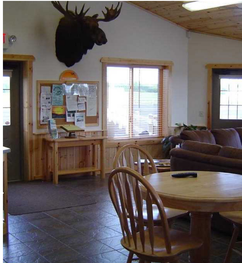
MAIN ENTRY TO OFFICE ADDITION WITH ADJACENT PARKING