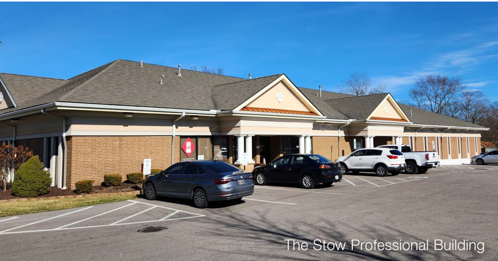
The Stow Professional Building