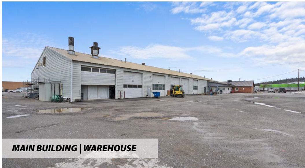
MAIN BUILDING | WAREHOUSE