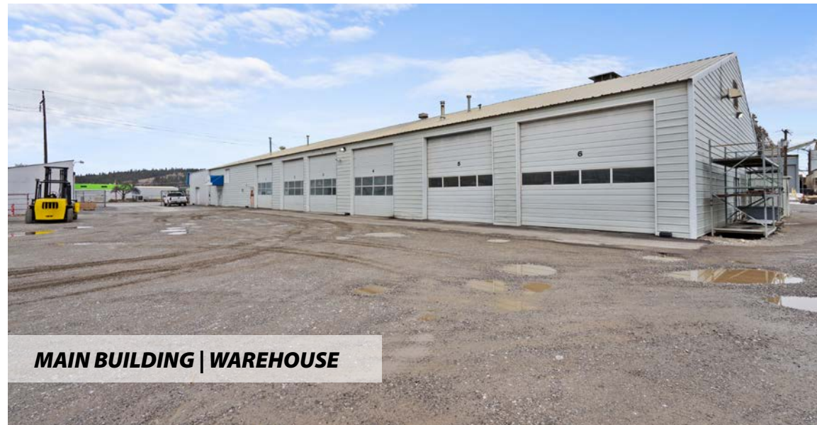
MAIN BUILDING | WAREHOUSE