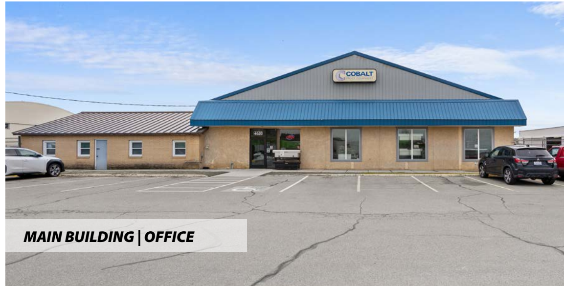
MAIN BUILDING | OFFICE