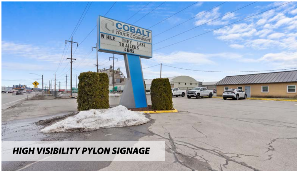
HIGH VISIBILITY PYLON SIGNAGE