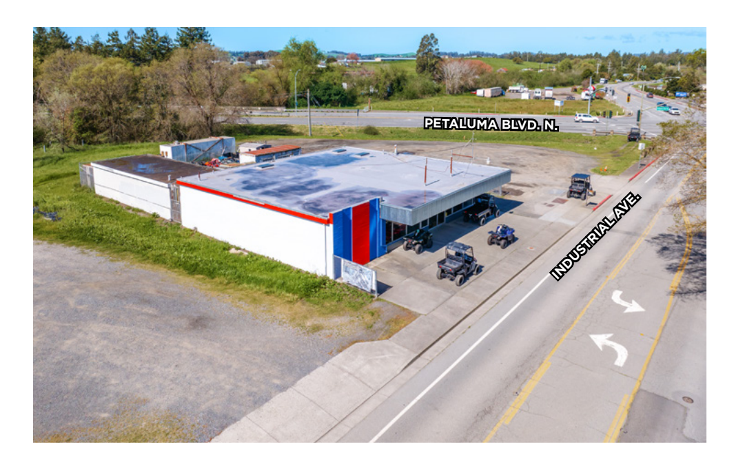
Zoning: Commercial 1 (C1). Click <u>HERE</u> for more zoning information.