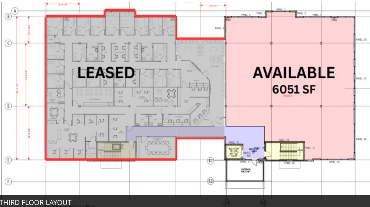
THIRD FLOOR LAYOUT Preliminary Space Plan

PRESENTED BY ASHLEY WALKER 407.430.3462 awalker@millenia-partners.com