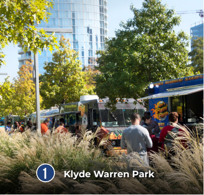
1 Klyde Warren Park