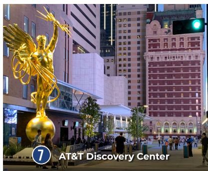
7 AT&T Discovery Center