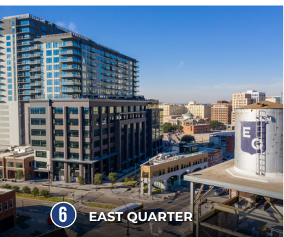
6 EAST QUARTER