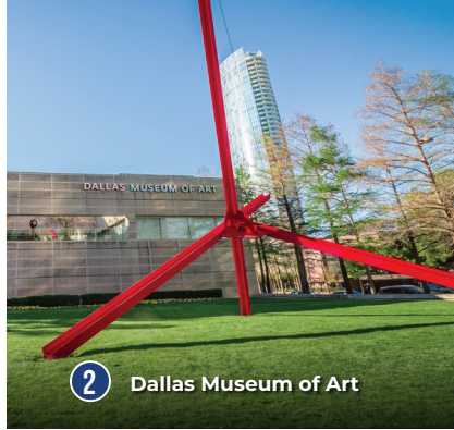
2 Dallas Museum of Art