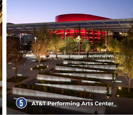
5 AT&T Performing Arts Center