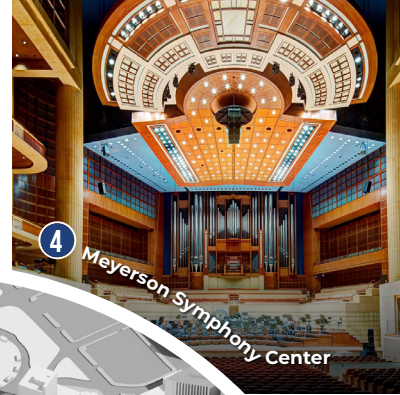
4 Meyerson Symphony Center