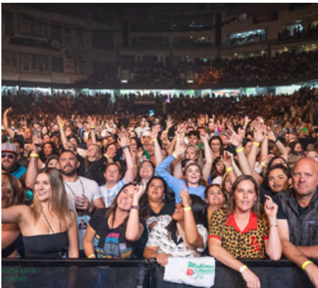
IDAHO CENTRAL ARENA