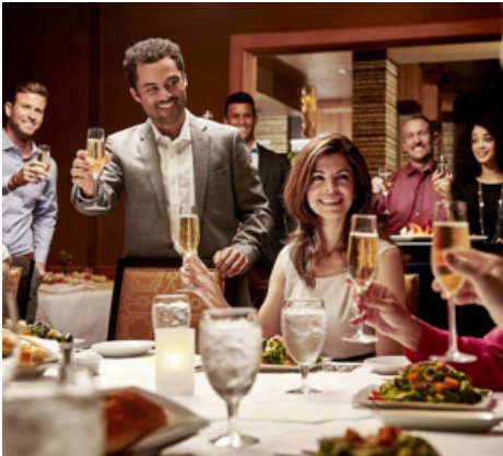
RUTH'S CHRIS STEAK HOUSE