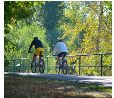
THE BOISE RIVER GREENBELT