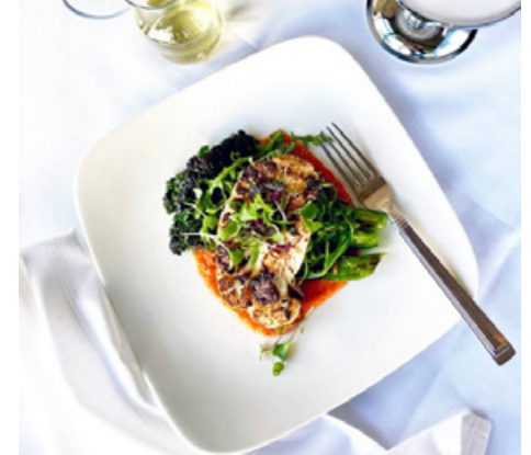
CHANDLERS STEAK HOUSE