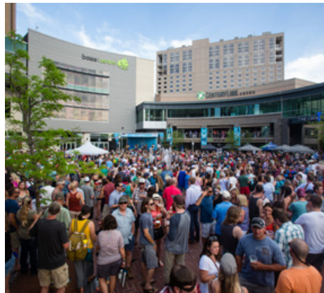
ALIVE AFTER 5