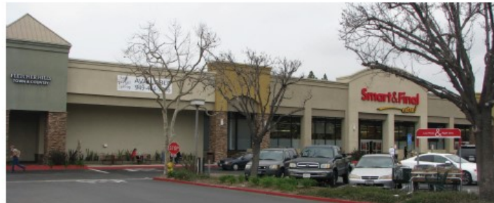
EXISTING PERSPECTIVE NOT TO SCALE

For more information about this property, please contact: