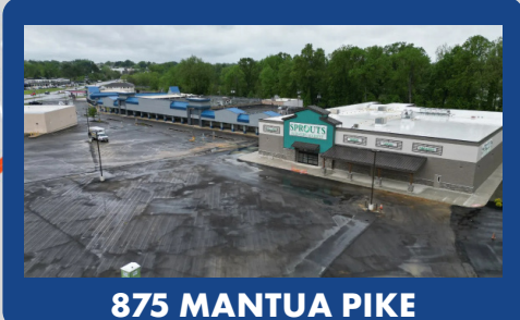
875 MANTUA PIKE