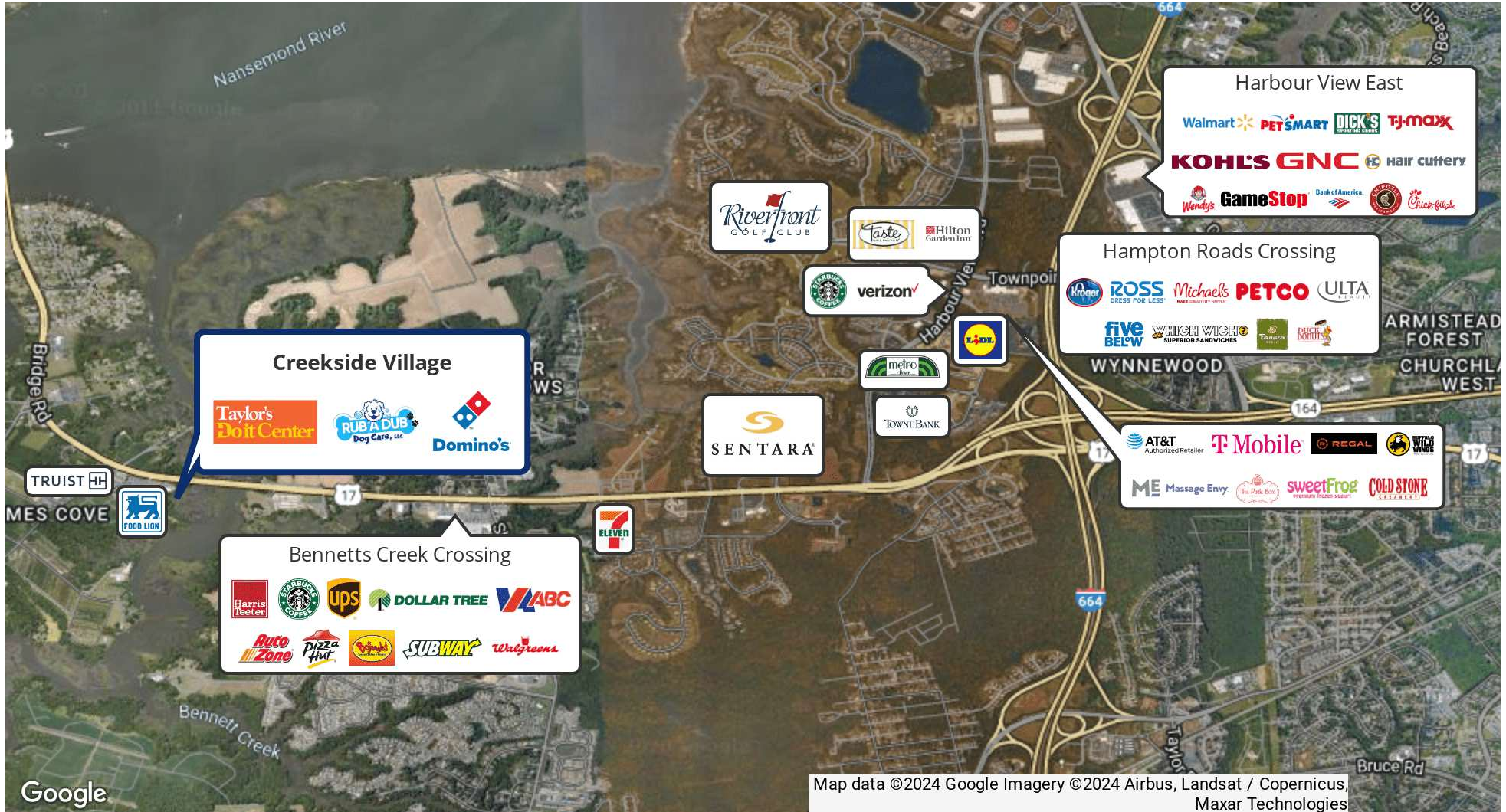
Map data ©2024 Google Imagery ©2024 Airbus, Landsat / Copernicus, Maxar Technologies

PIERCE JACOBSON PARTNER | SHOPPING CENTER LEASING O. 757.452.6141 PJACOBSON@SLNUSBAUM.COM