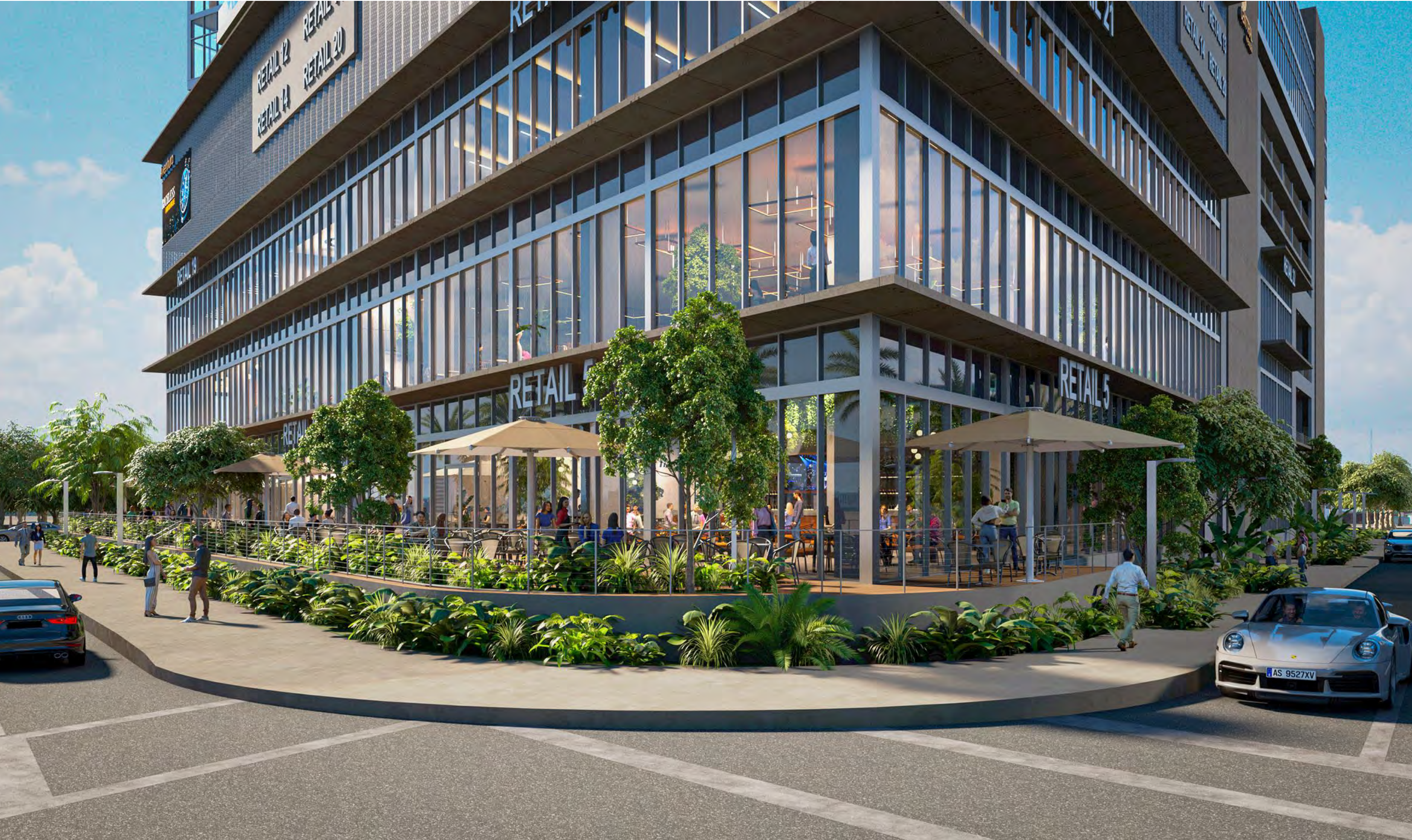
SOUTH CORNER - RESTAURANT SPACE WITH TERRACE