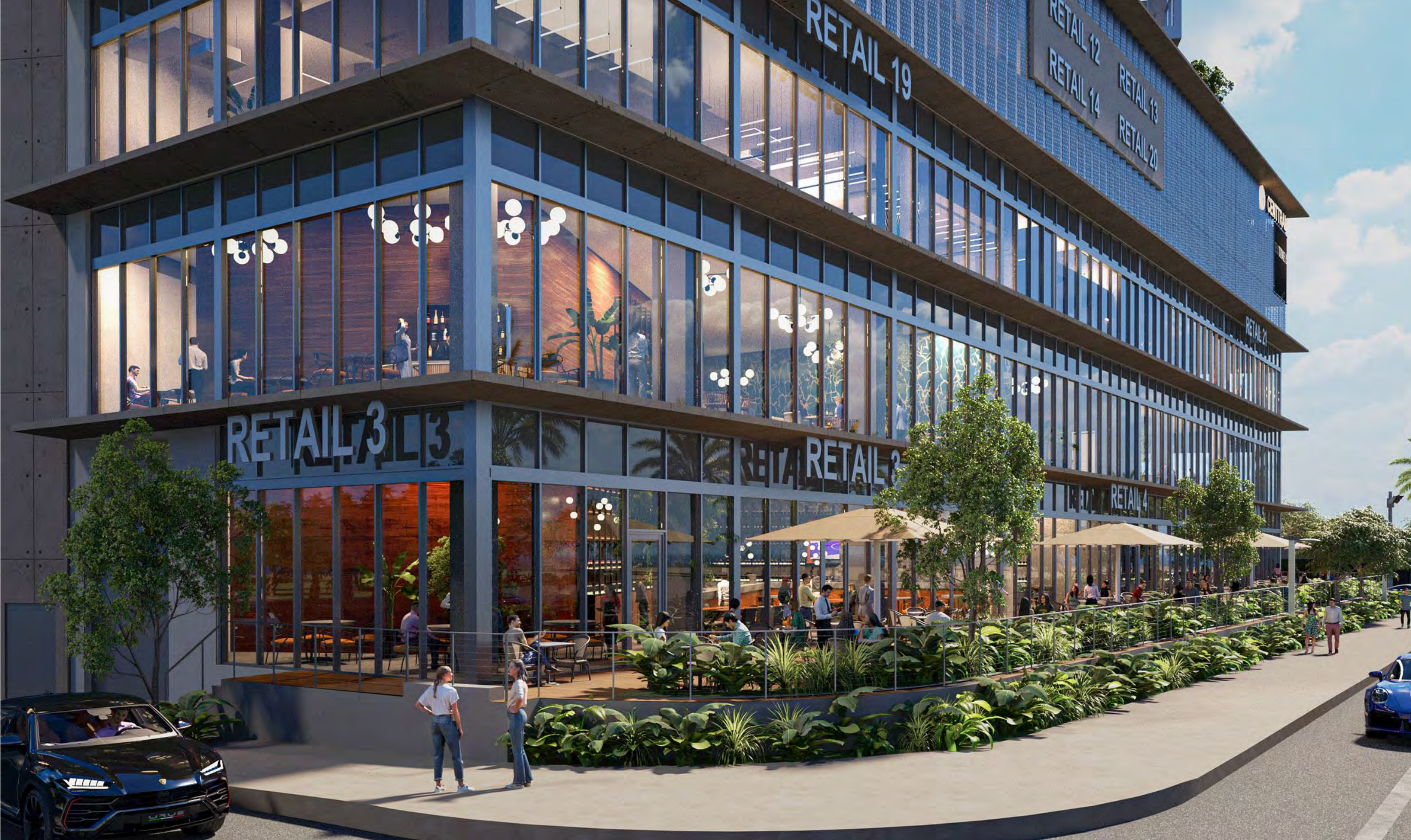
NORTH CORNER - RESTAURANT SPACE WITH TERRACE