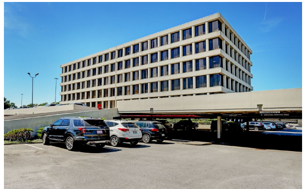
Abundant Parking Options