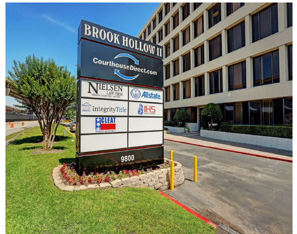
Tenant Signage Opportunity