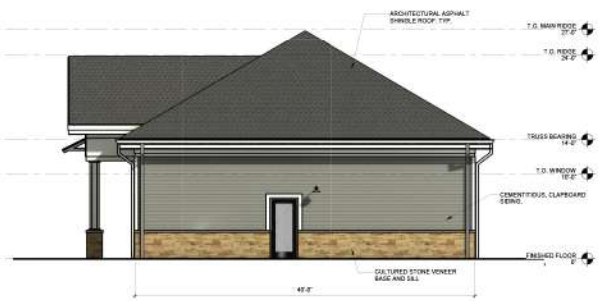
C-STORE - SIDE 1 3/16" = 1'-0"