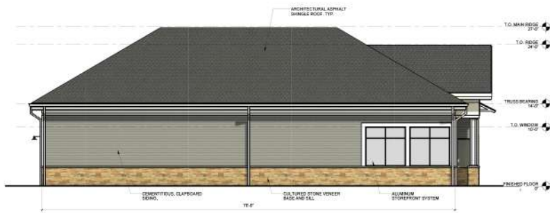
C-STORE - REAR 3/16" = 1'-0"