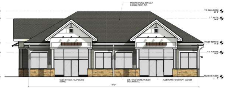
C-STORE - FRONT 3/16" = 1'-0"