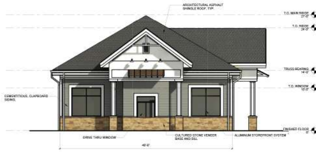
C-STORE - SIDE 2 (DRIVE THRU) 3/16" = 1'-0"