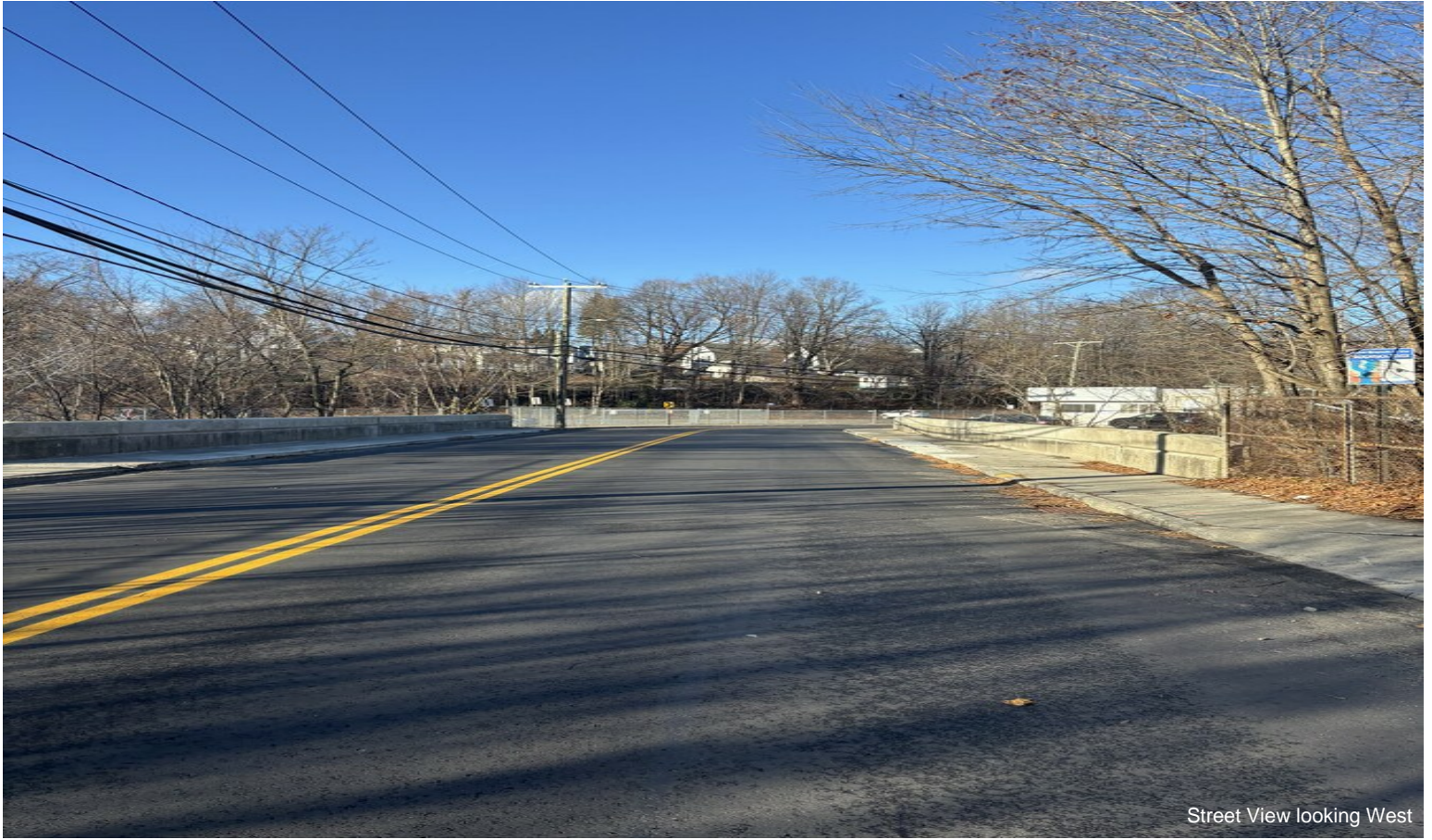
Street View looking West