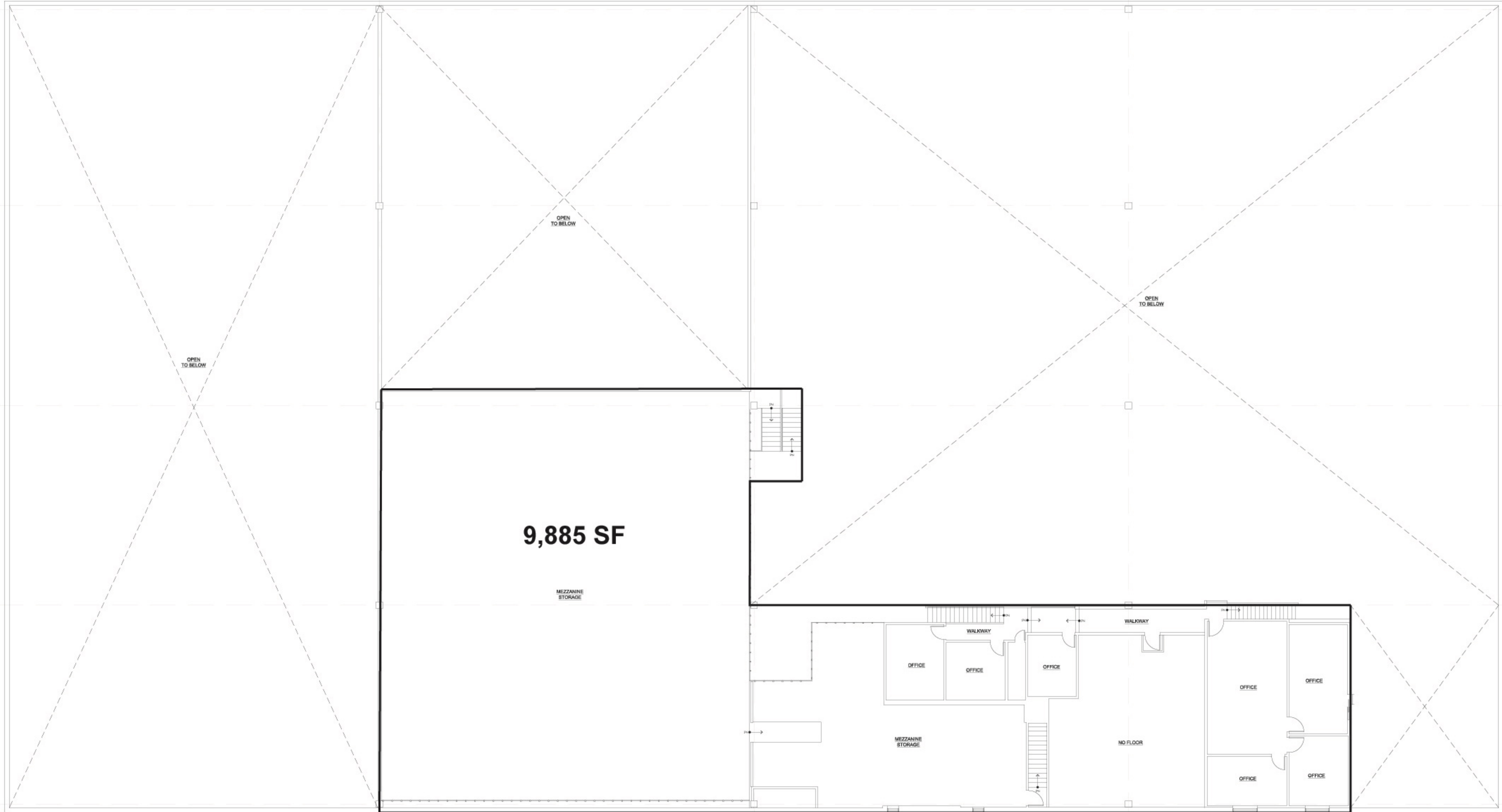
UPPER LEVEL FLOOR PLAN 1" = 10'-0" 9,885 S.F. NORTH

© COPYRIGHT 2022 BY RICK FORNSTER - ARCHITECT, LLC. ALL RIGHTS RESERVED. THIS DRAWING IS THE PROPERTY OF RICK FORNSTER - ARCHITECT, LLC. IT IS TO BE USED ONLY FOR THE PROJECT AND IN CONNECTION WITH THE SPECIFIED PROJECT. NO PART OF THIS DRAWING IS TO BE REPRODUCED OR TRANSMITTED IN ANY FORM OR BY ANY MEANS, ELECTRONIC OR MECHANICAL, INCLUDING PHOTOCOPYING, RECORDING, OR BY ANY INFORMATION STORAGE AND RETRIEVAL SYSTEM, WITHOUT THE WRITTEN PERMISSION OF RICK FORNSTER - ARCHITECT, LLC. THE USER OF THIS DRAWING SHALL BE RESPONSIBLE FOR OBTAINING ALL NECESSARY PERMITS AND APPROVALS FROM THE APPROPRIATE AGENCIES AND AUTHORITIES. THE USER SHALL BE RESPONSIBLE FOR THE ACCURACY OF ALL INFORMATION AND DATA PROVIDED TO THE ARCHITECT. THE ARCHITECT SHALL NOT BE RESPONSIBLE FOR THE ACCURACY OF ANY INFORMATION OR DATA PROVIDED TO THE ARCHITECT THAT WAS NOT OBTAINED FROM THE ARCHITECT'S SOURCE. THE ARCHITECT SHALL NOT BE RESPONSIBLE FOR THE ACCURACY OF ANY INFORMATION OR DATA PROVIDED TO THE ARCHITECT THAT WAS NOT OBTAINED FROM THE ARCHITECT'S SOURCE.