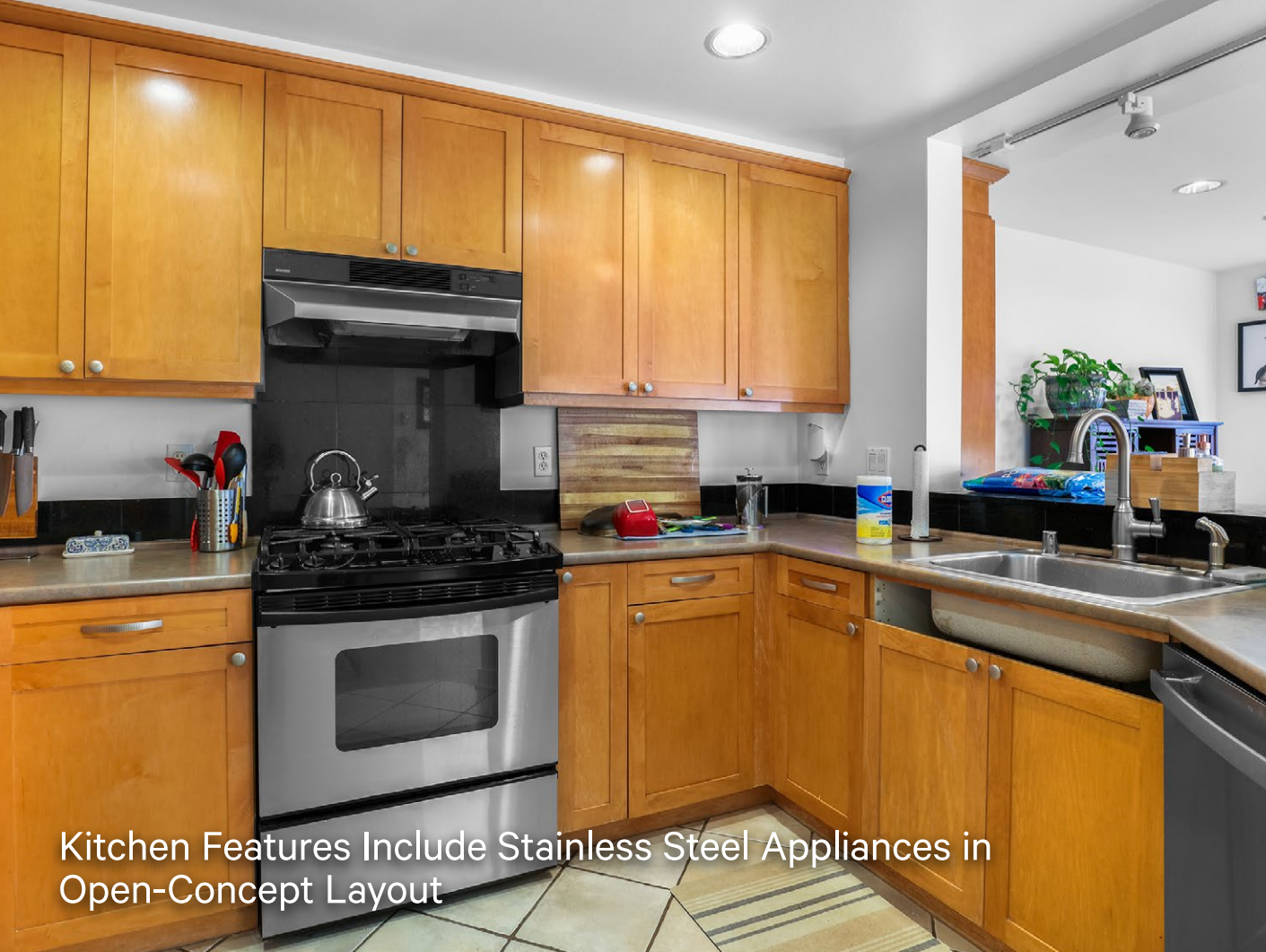
Kitchen Features Include Stainless Steel Appliances in Open-Concept Layout