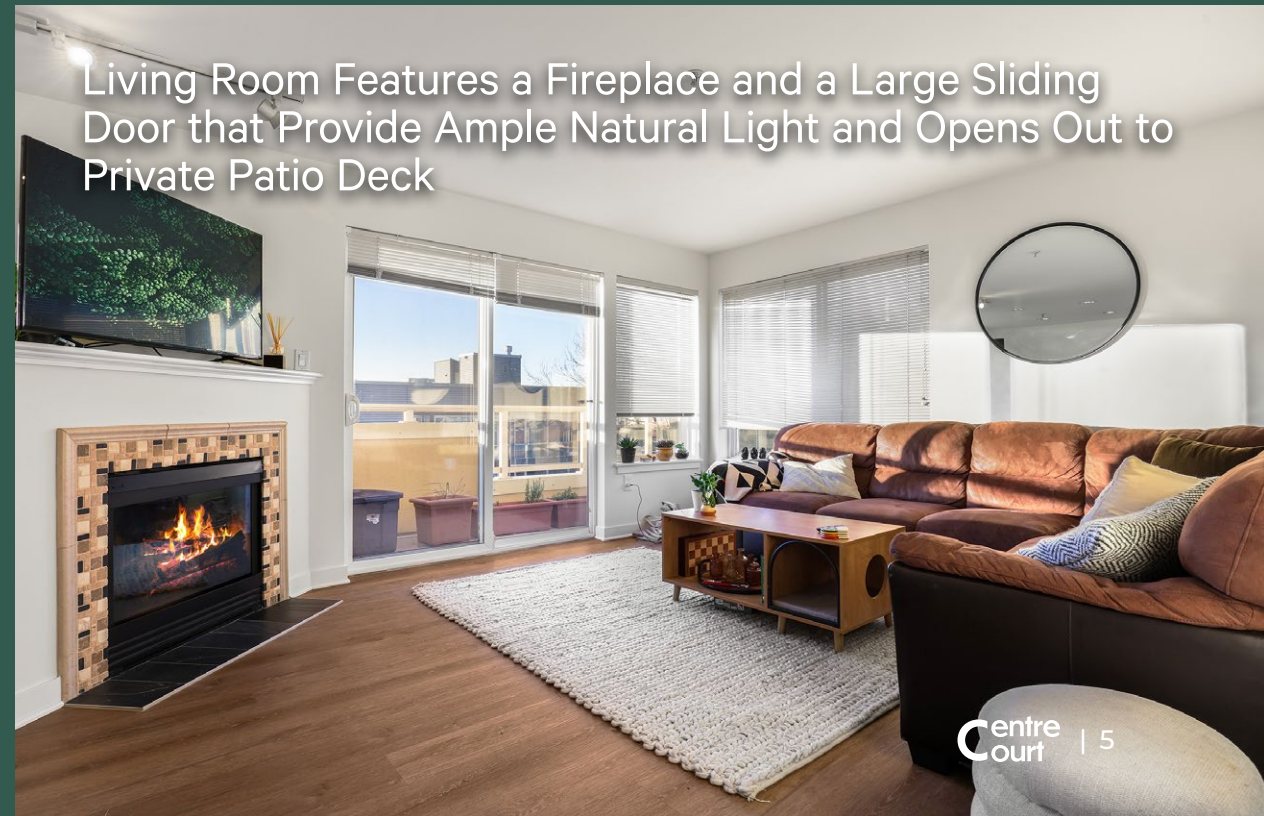
Living Room Features a Fireplace and a Large Sliding Door that Provide Ample Natural Light and Opens Out to Private Patio Deck