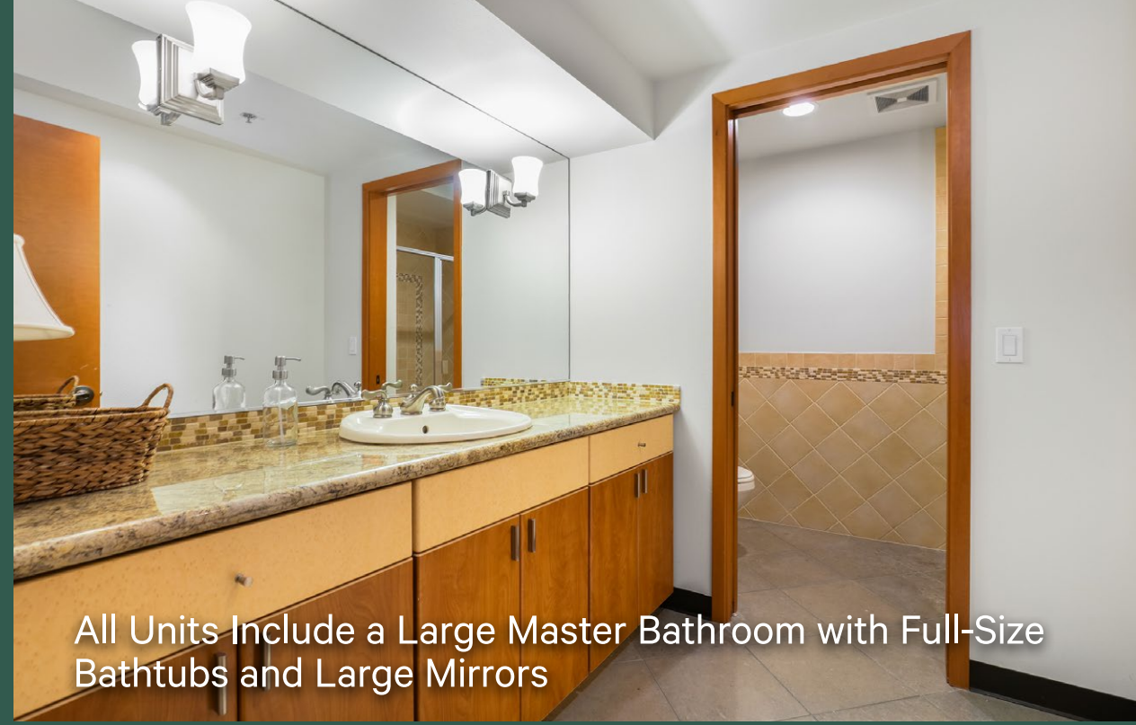
All Units Include a Large Master Bathroom with Full-Size Bathtubs and Large Mirrors