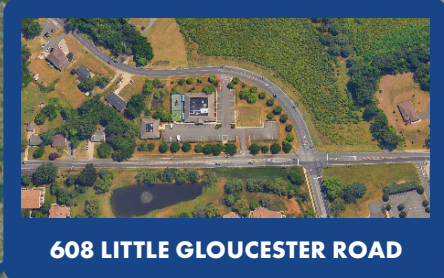
608 LITTLE GLOUCESTER ROAD