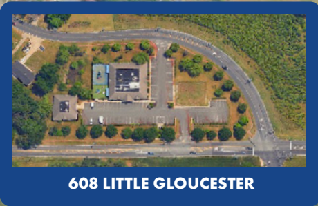
608 LITTLE GLOUCESTER