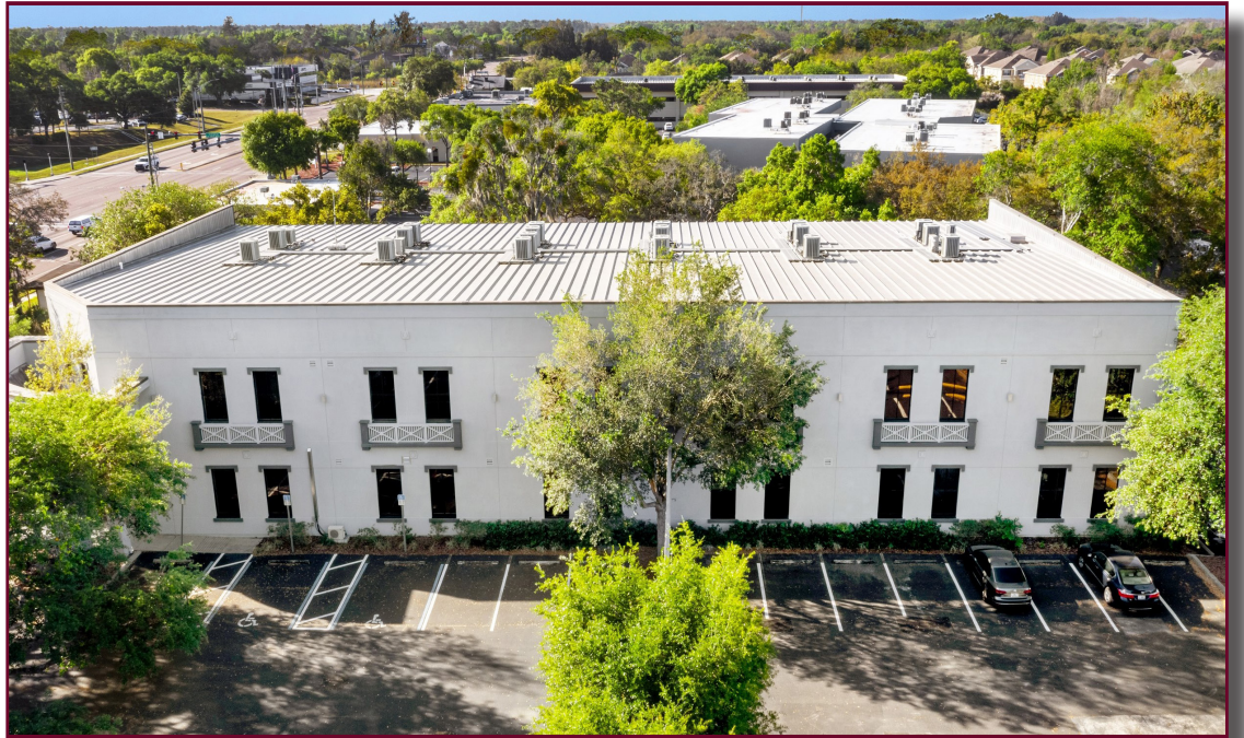
Surrounded by beautiful and mature landscaping