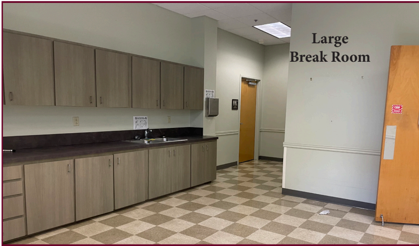
Ste. 102 Interior Pics