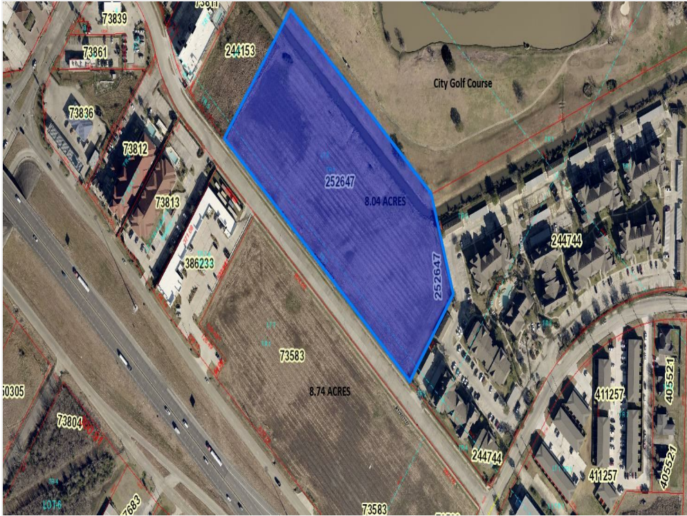
View of Both Tracts of Land