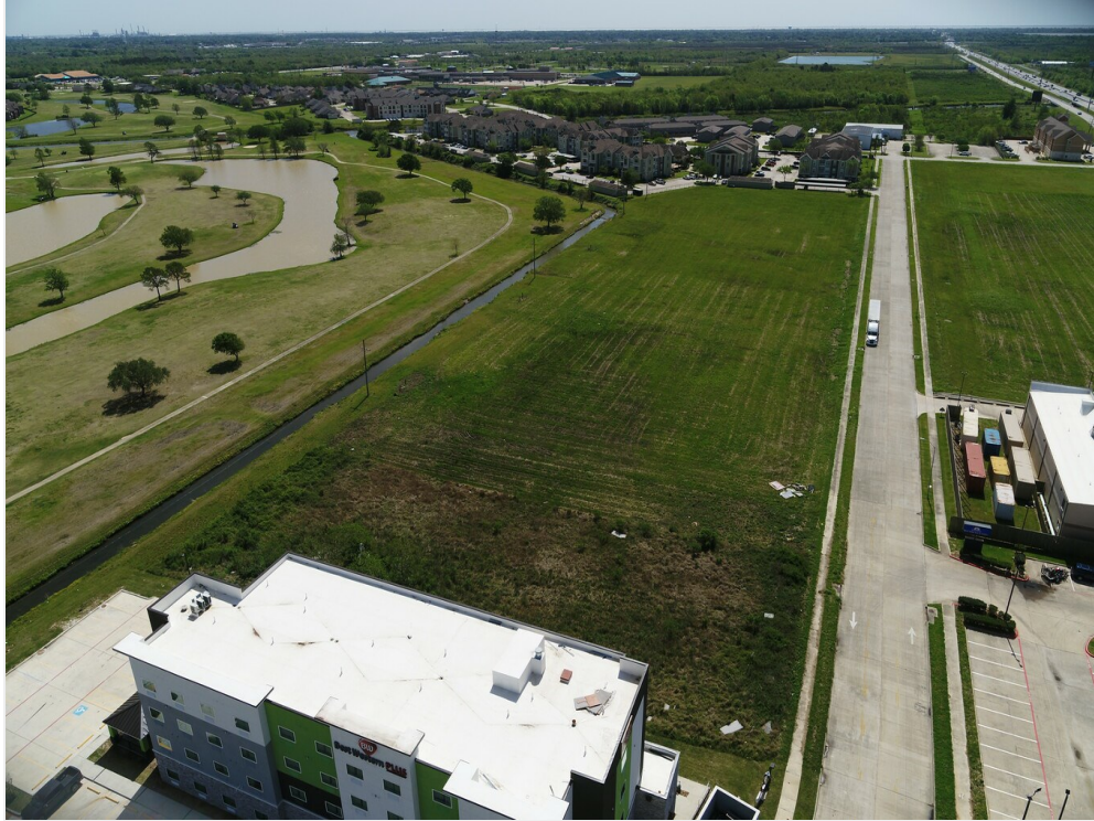
8.74 Acres Off feeder Rd