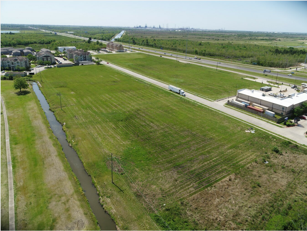
8.04 Acres Near Golf Course