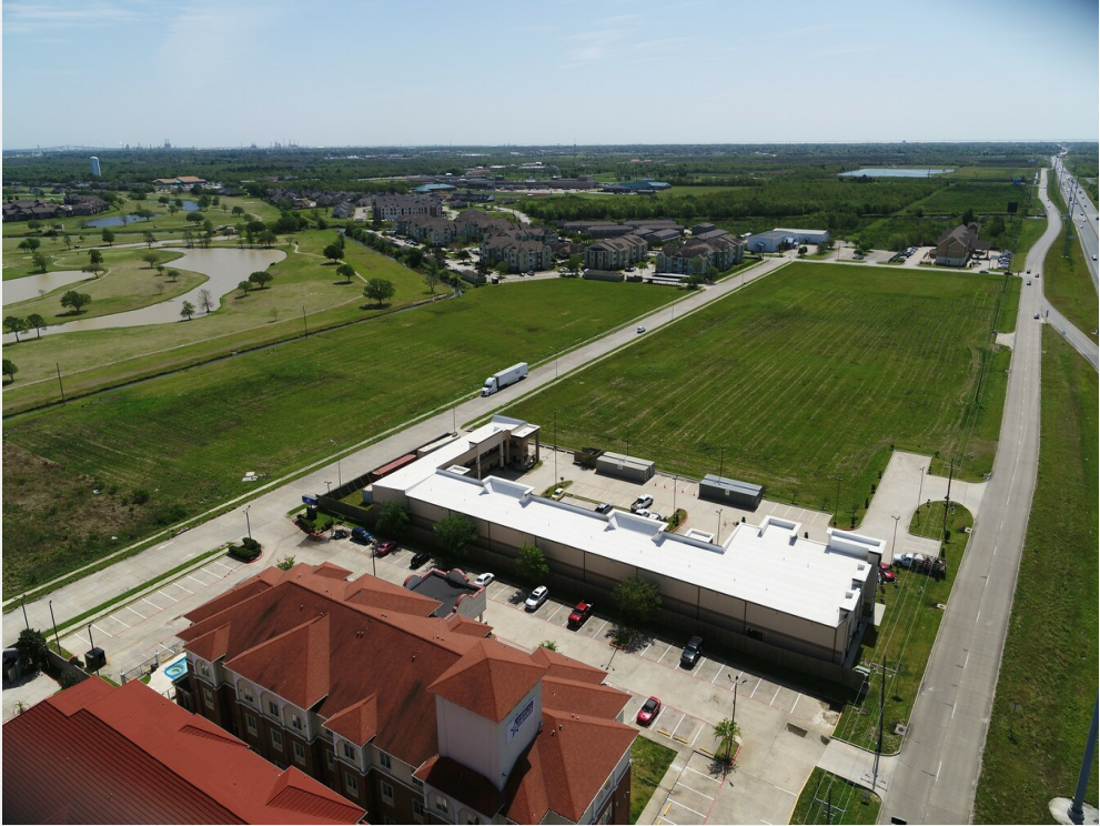
8.74 Acres Off feeder Rd