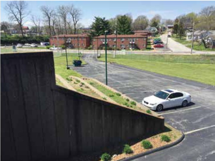
all gated and fenced