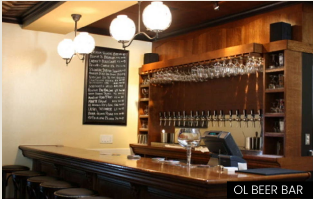
OL BEER BAR