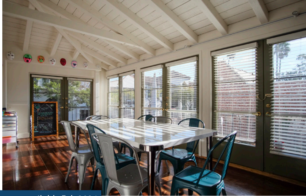
1029 State St — Office space, available Feb 2024