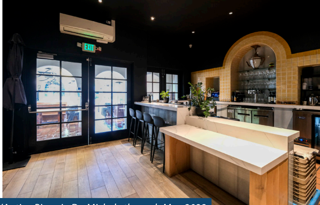
1031 State St — 2,508 SF restaurant, lease to L'Antica Pizzeria Da Michele through May 2032