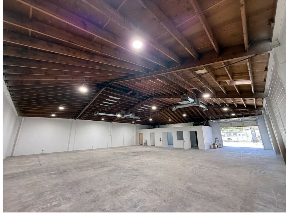
Interior view of building 3605