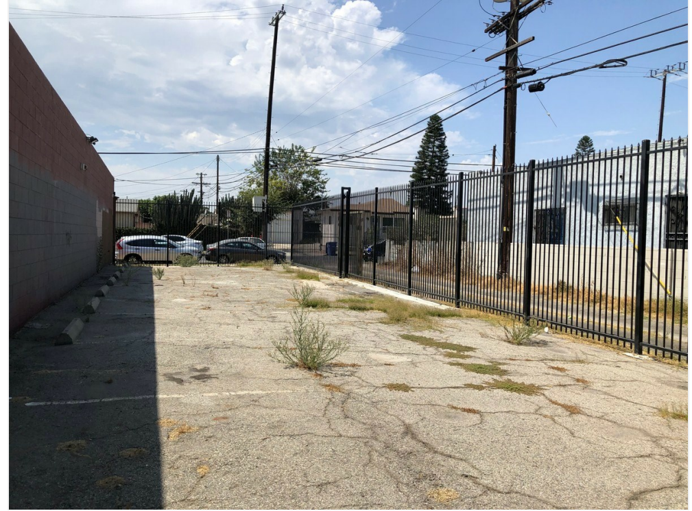
Interior fenced parking lot #2 w/access to bldg