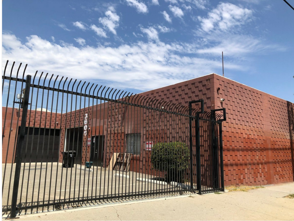
Remote controlled gate