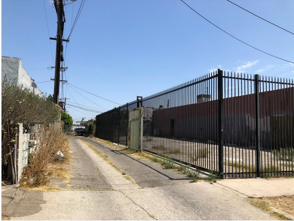
Additional fenced parking lot #2