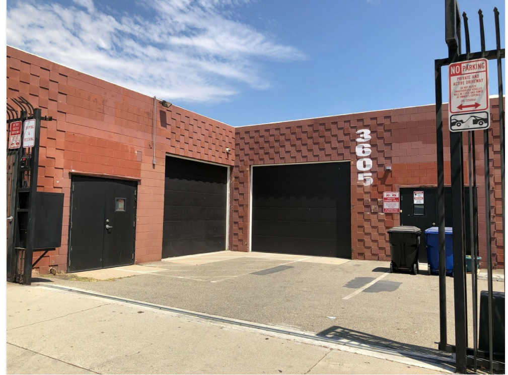
Remote controlled gated parking