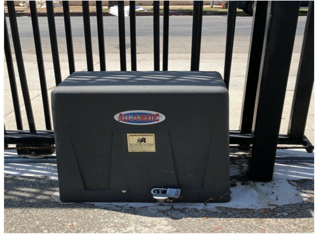
automatic gate opener