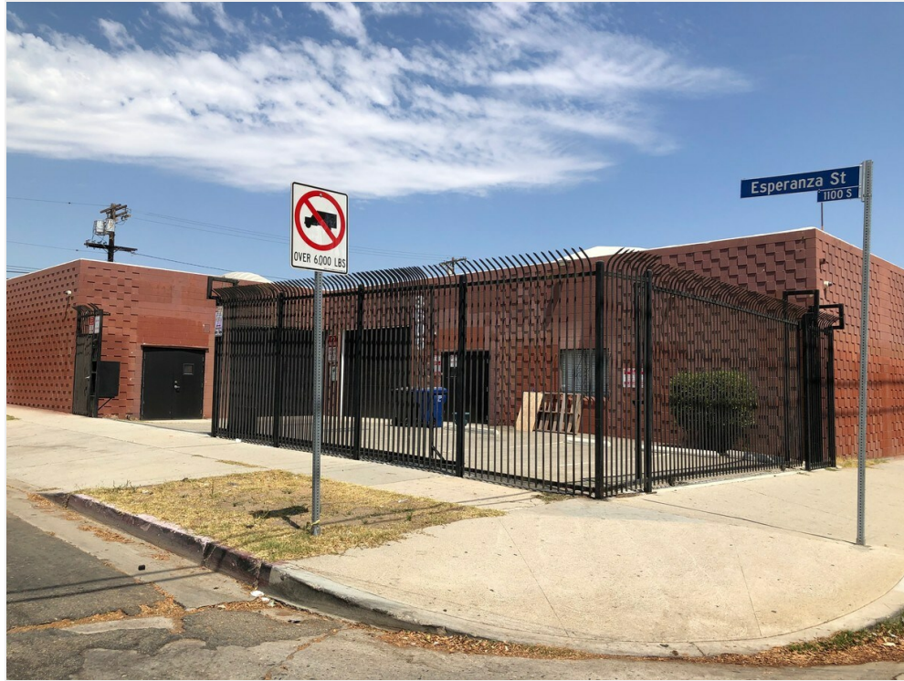
Corner of Esperanza and E 8th St