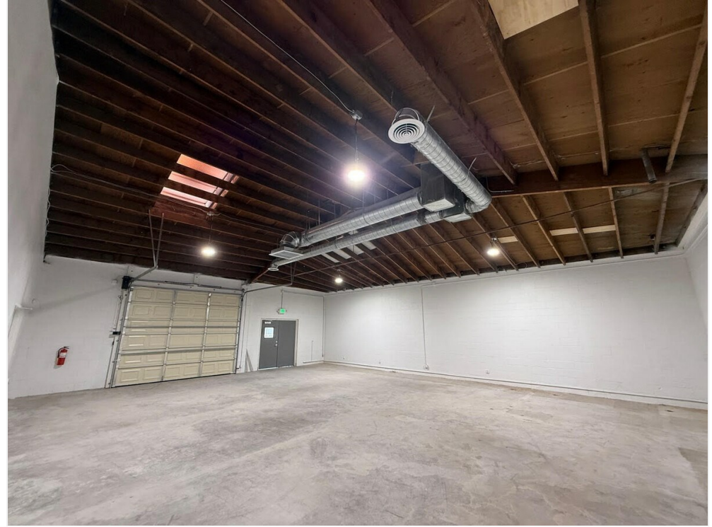
Interior view with ground level door