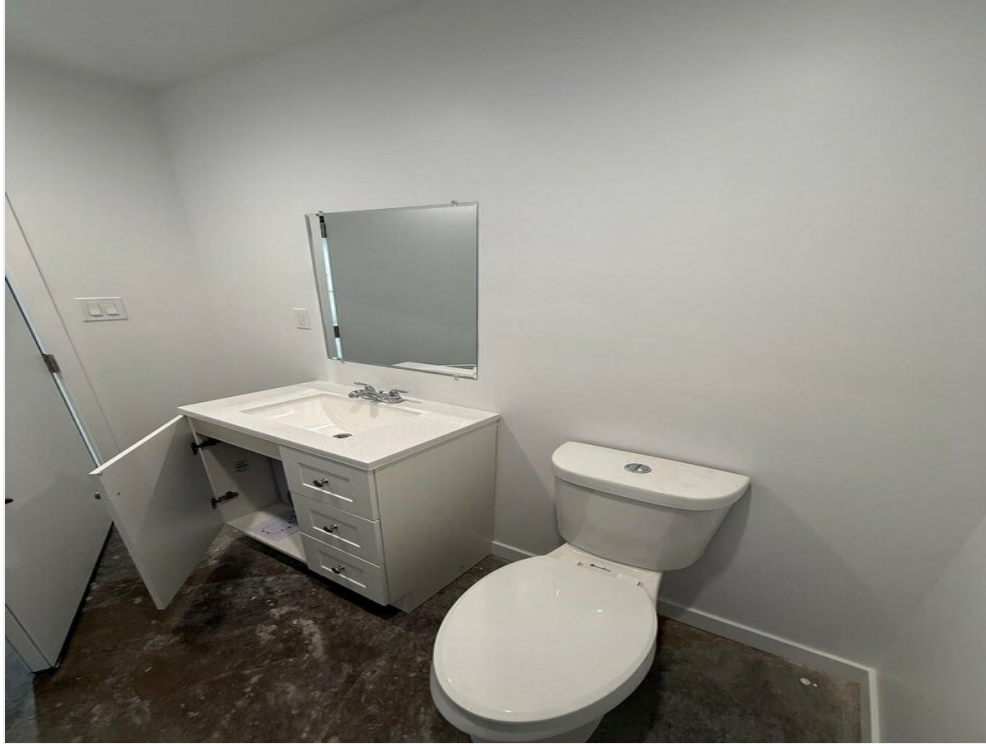
2 of 2 restrooms