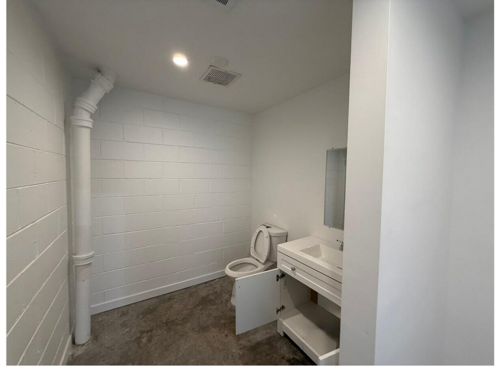
1 of 2 restrooms