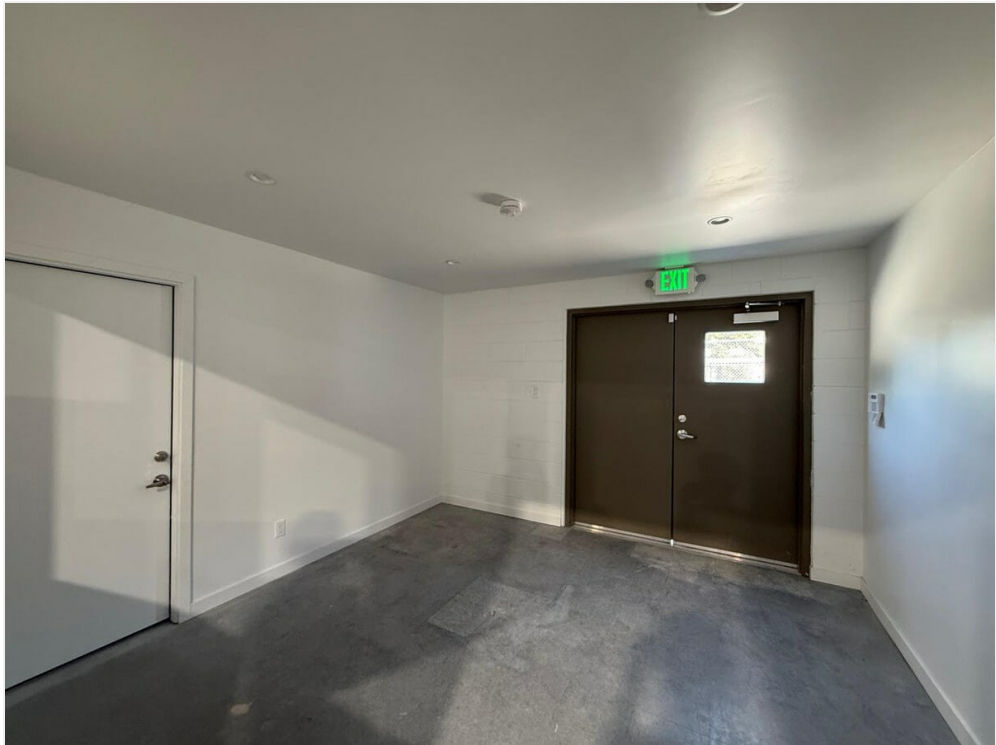
Steel double doors