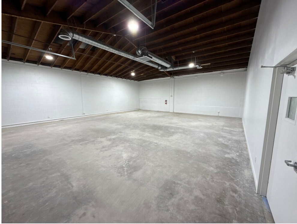
Interior view of conjoined building