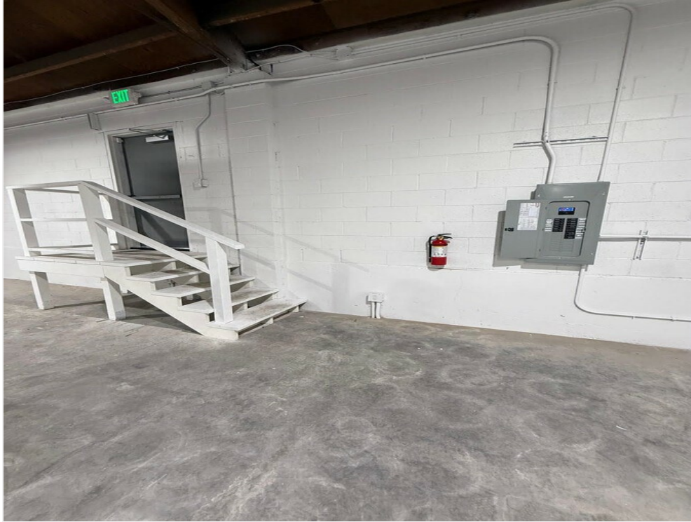
Stairs to side fenced parking lot