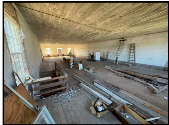
Unfinished Second Story