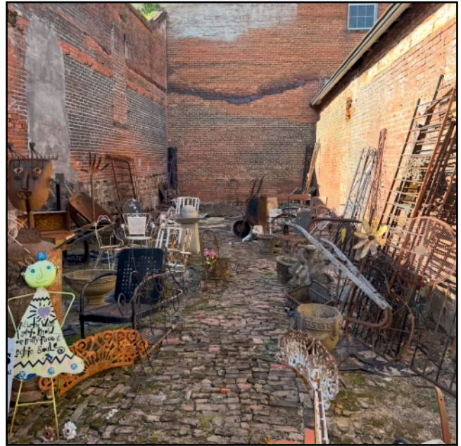
Old Jail/Outdoor Courtyard Area