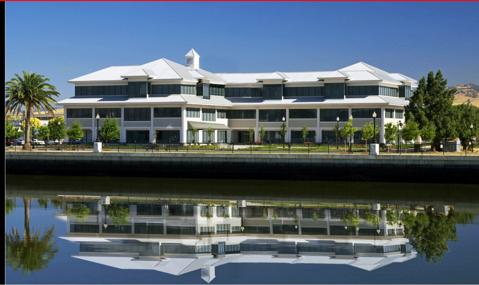
One Harbor Center Suisun City, CA 94585